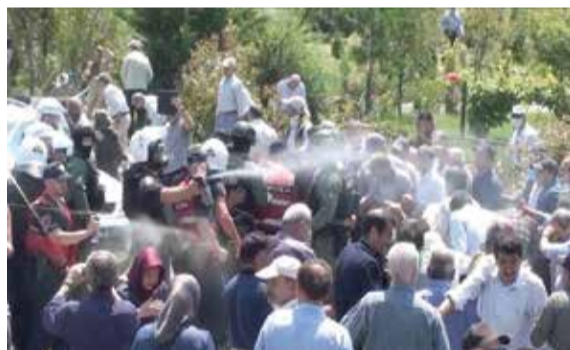
Albanian police forces clash with members of the MKO during a raid into the terrorist cult's Camp Ashraf-3 in Tirana, Albania, on June 20, 2023.