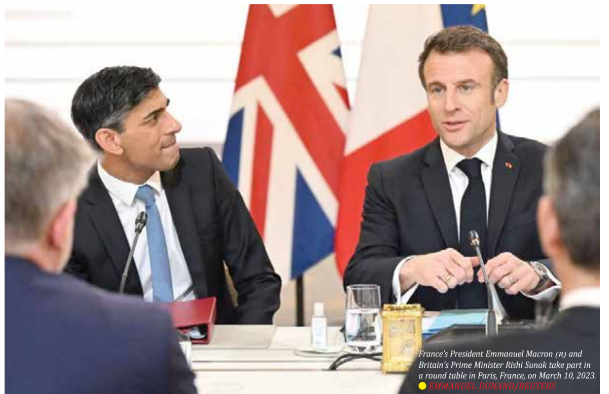
France's President Emmanuel Macron (r) and Britain's Prime Minister Rishi Sunak take part in a round table in Paris, France, on March 10, 2023.

British diplomats included Iran’s own breach of the accord, Iran’s alleged sale of drones to Russia for use in the Ukraine war, and the possible future transfers to Russia of Iran’s ballistic missiles. The head of the UN’s nuclear weapons inspectorate, Rafael Grossi, admitted last week that an agreement on monitoring the Iranian nuclear programme had become very limited and fragmented. Iranian MPs, on the other hand, have been objecting to the planned installation of about 10 security cameras in the centrifuge production workshop at a site in Isfahan. The EU sanctions are due to expire on 18 October under a UN resolution that enshrined the 2015 nuclear deal. The sanctions “called upon” Iran not to do anything to develop ballistic missiles that could carry nuclear weapons. They also barred anyone