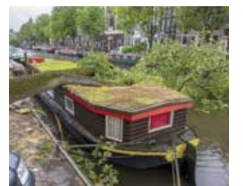
A tree uprooted by Storm Poly landed on a houseboat in Amsterdam, on July 5, 2023.

It was the "first very severe summer storm ever measured" in the country, Dutch weather service Weerplaza said, adding that the gusts were also the strongest ever recorded in the summer in the Netherlands.