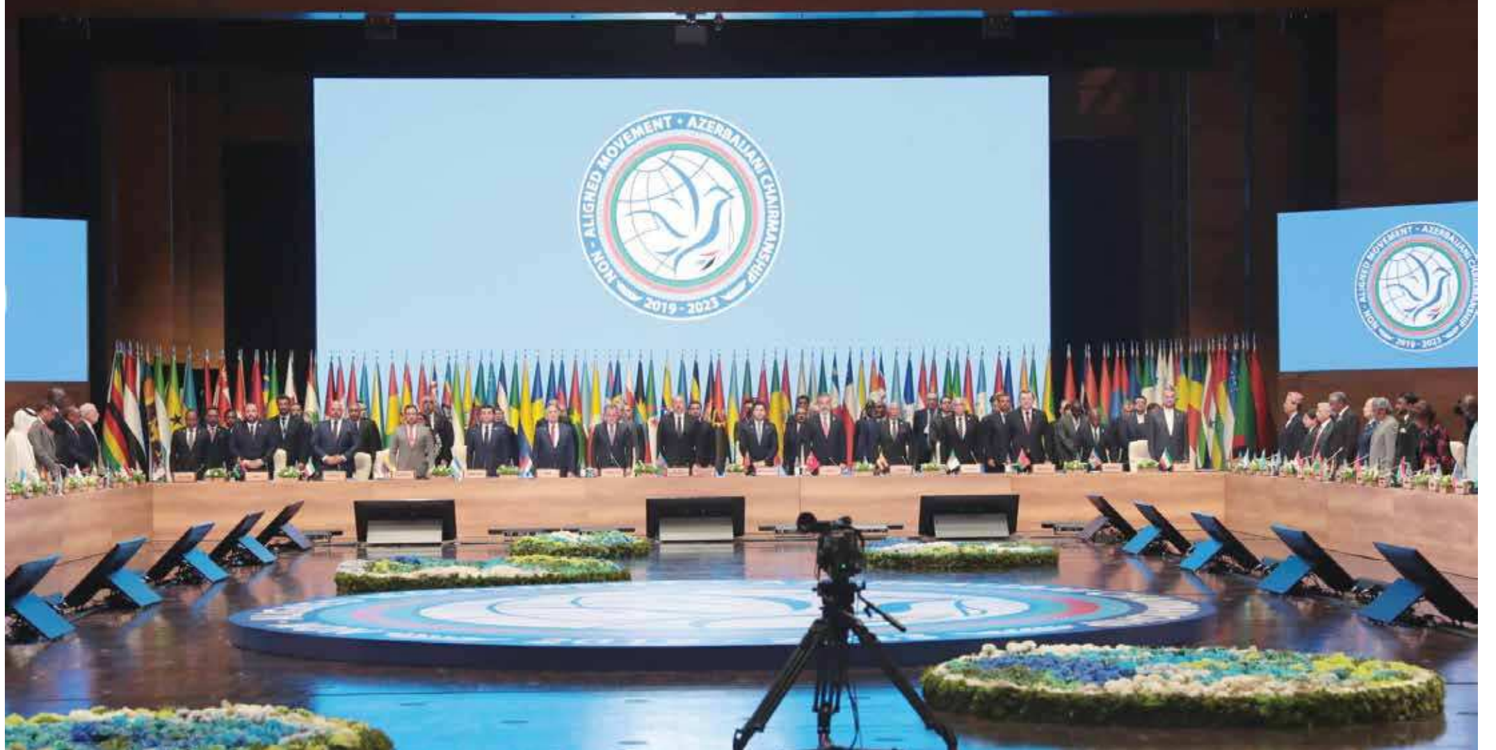
The photo shows a general view of the conference hall at the start of the ministerial meeting of the Non-Aligned Movement in Baku, Azerbaijan, on July 5, 2023.