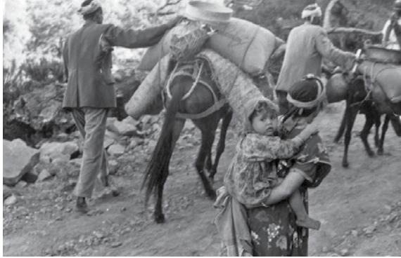
A kid on her mother's back looks at the camera, as her family in an Algerian village is displaced after a French air raid in 1957.

Vol. 7332 • Thursday, July 6, 2023 • Price 40,000 Rials • 8 Pages