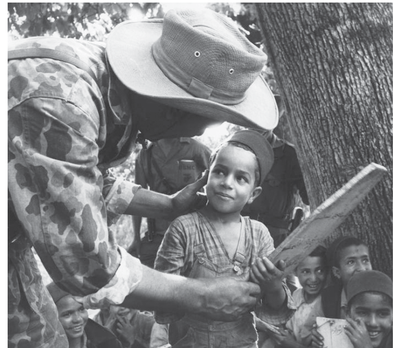
An officer of Algeria's National Liberation Army pats a child on the back in rural areas of the country in 1957.