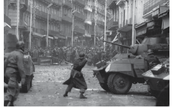
Algerian opponents of peace with France clash with French forces as they demonstrate on a street in 1960.