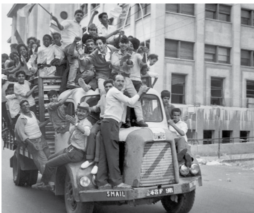
A group of Algerian people on a truck rejoices after the announcement of the referendum result and Algerian Independence in 1962.