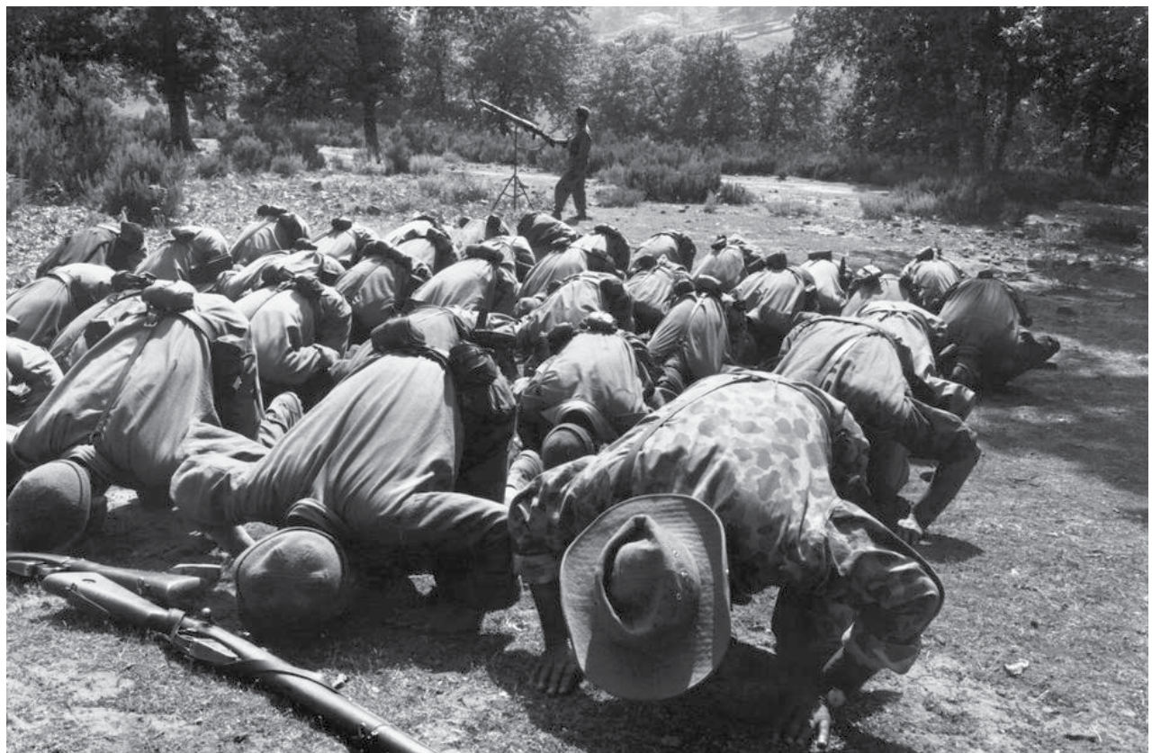
The photo, taken in 1957, shows soldiers of Algeria's National Liberation Army performing congregational prayers.