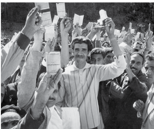
Voters show their ballots on Algerian independence referendum day on July 1, 1962.