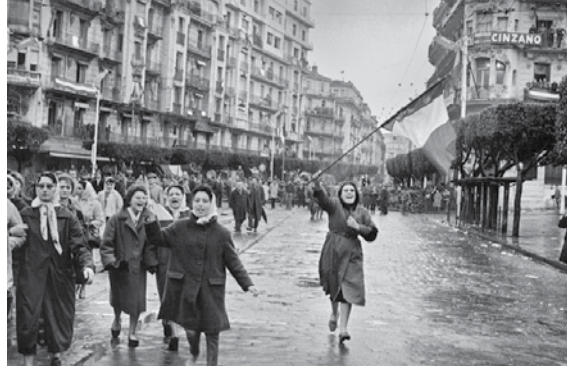
A group of revolutionary women demonstrates on a street in Algeria in 1960.