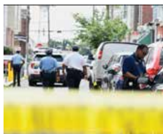
Police officers work at the scene as investigations are ongoing the day after a mass shooting in the Kingsessing section of southwest Philadelphia, Pennsylvania, U.S. on July 4, 2023.