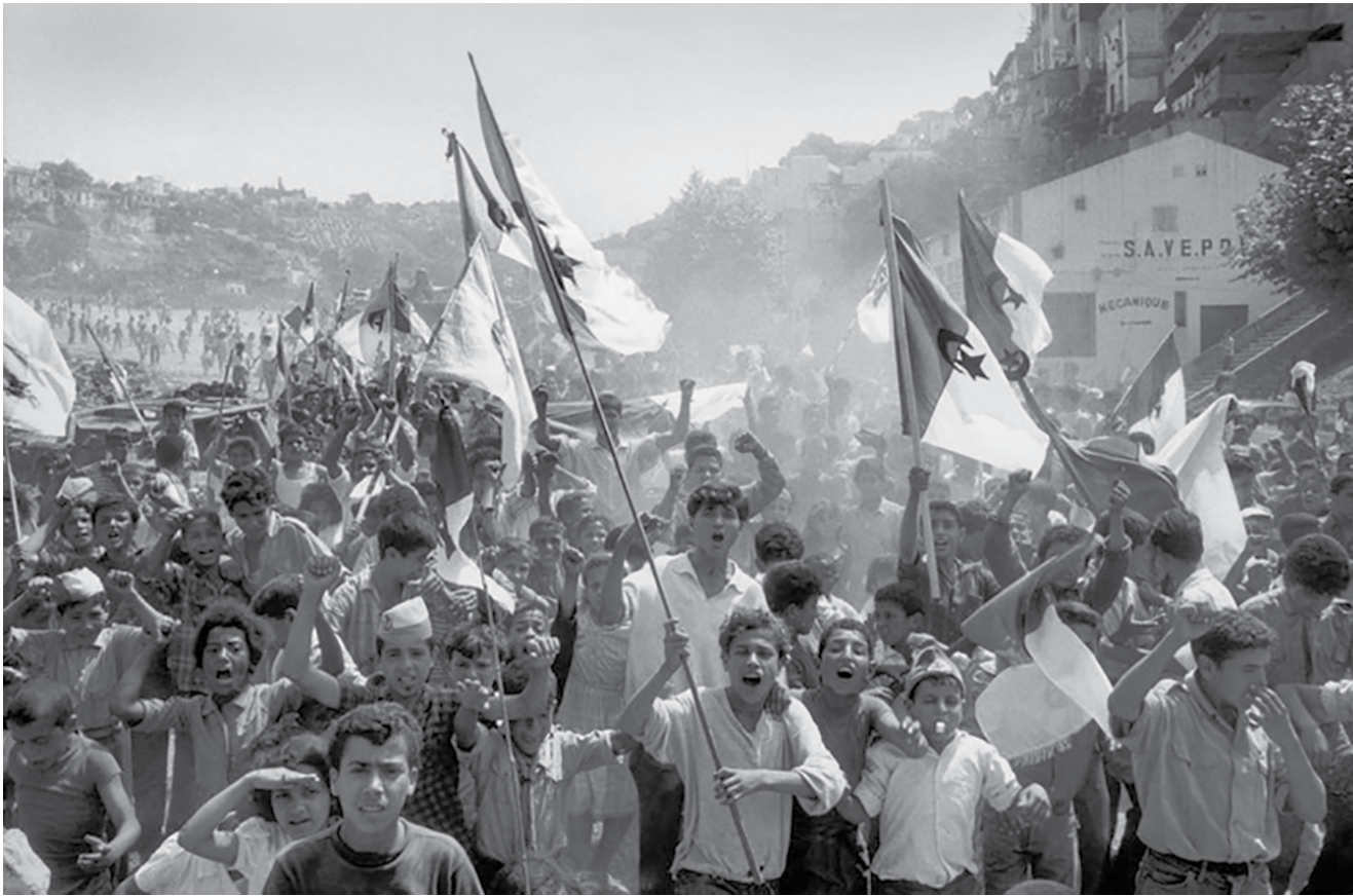
The youth of an Algerian village rejoice after the announcement of the referendum result and Algerian Independence in 1962.