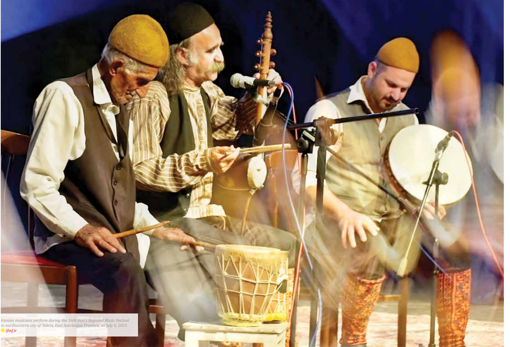
Iranian musicians perform during the 16th Iran's Regional Music Festival in northwestern city of Tabriz, East Azarbaijan Province, on July 6, 2023.