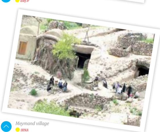
Meymand village