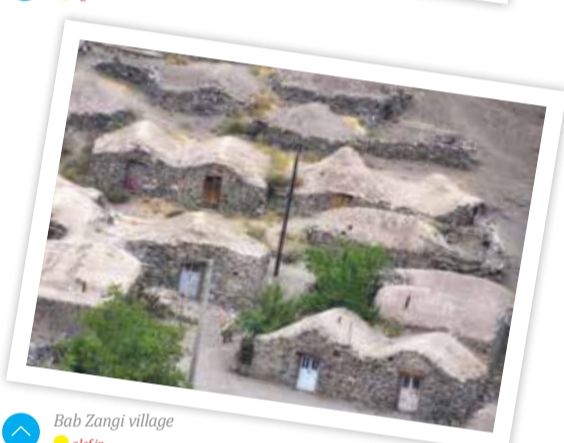
Bab Zangi village alef.ir