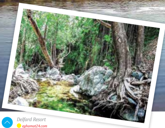
Delfard Resort