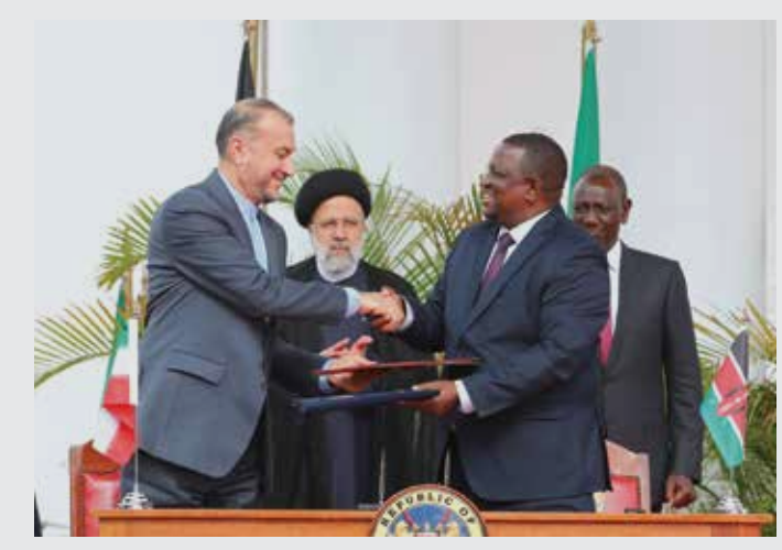
Foreign ministers of Iran and Kenya shake hands after signing MoUs.