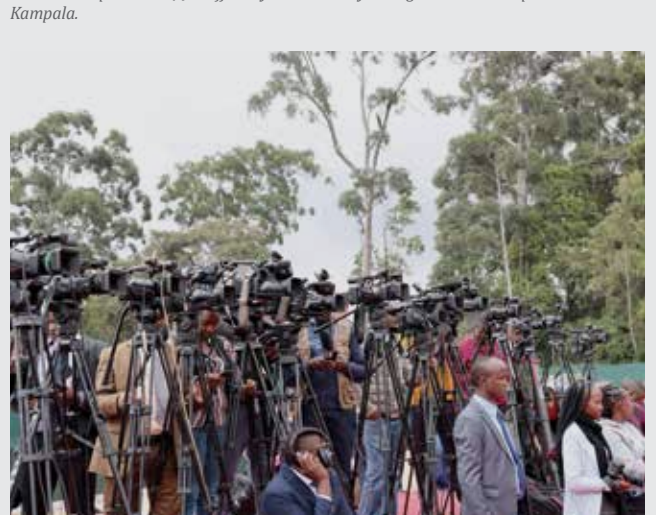
Local and international reporters scramble to cover the latest news of the joint press conference in Nairobi, Kenya.