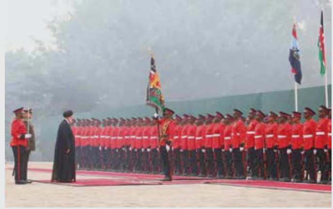
The Iranian president is officially welcomed in the Kenyan Presidential Palace.