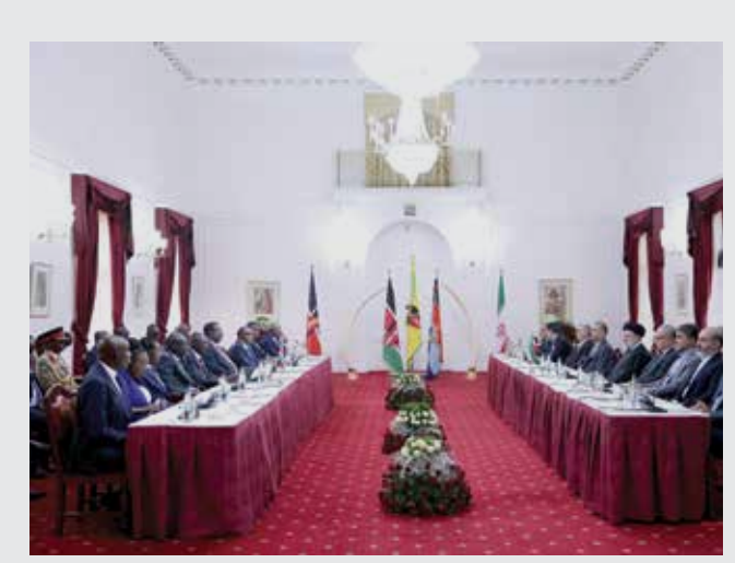
High-ranking delegations headed by Raeisi (C-R) and Ruto (C-L) engage in direct,