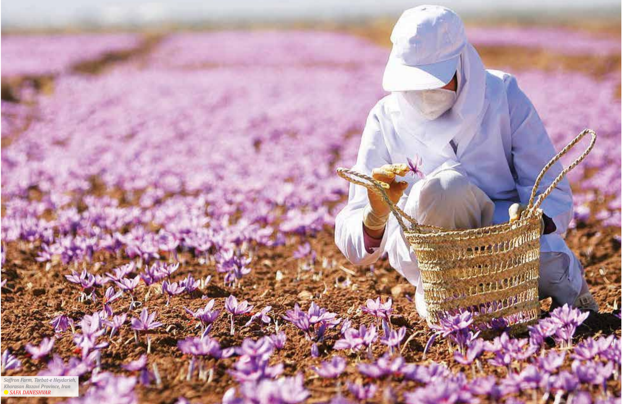
Saffron Farm, Torbat-e Heydarieh, Khorasan Razavi Province, Iran