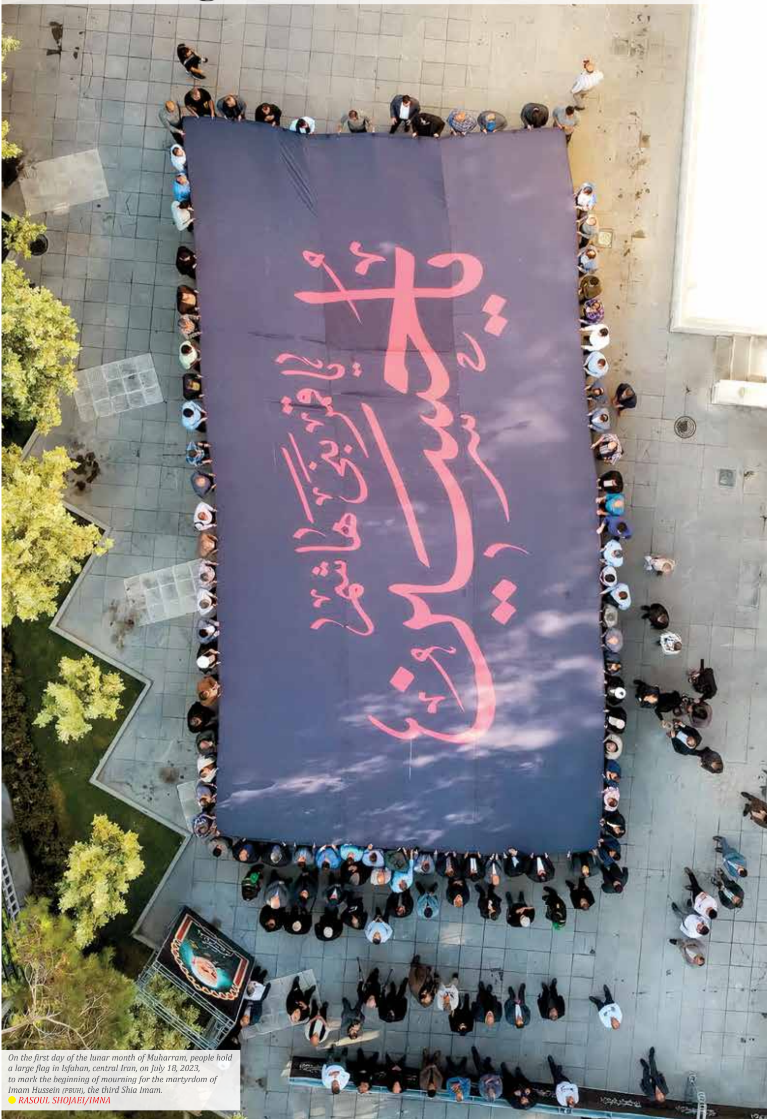
On the first day of the lunar month of Muharram, people hold a large flag in Isfahan, central Iran, on July 18, 2023, to mark the beginning of mourning for the martyrdom of Imam Hussein (عليه السلام), the third Shia Imam.