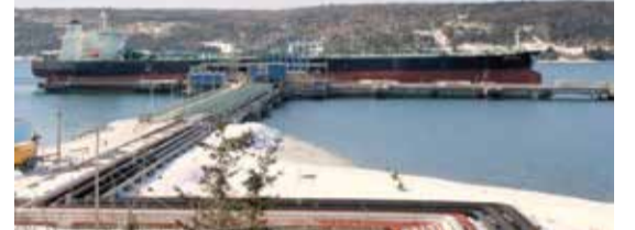
Suez Rajan tanker

US federal prosecutors can't auction off 800,000 barrels of seized Iranian oil sitting in a Greek tanker off the coast of Texas because US companies are reluctant to unload it, according to people familiar with the matter. Prosecutors commandeered the Suez Rajan tanker carrying the oil earlier this year after charging its Greek owner with sanctions evasion, and directing the ship into the muddy-green waters 65 miles off Galveston's coast, the Wall Street Journal wrote. The US Coast Guard cleared the tanker for unloading, but the companies that manage those transfers — known as lightering — say they are too worried about Iranian reprisal to handle the captured oil. "Companies with any exposure whatsoever in the Persian Gulf are literally afraid to do it," said a Houston-based energy executive involved in the matter. The executive said that several of the companies contacted about unloading the oil declined. Another executive at a shipping company involved in lightering in the Gulf of Mexico also said, "I don't know if anybody's going to touch it."