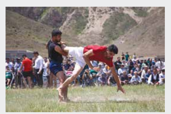
Locho wrestling is a traditional field of Pahlavani sports practiced in the northern Iranian province of Mazandaran.

Annually, the people of Mazandaran gather together on July 19 to hold the Feast of the Dead, a part of which is the Locho wrestling contest.