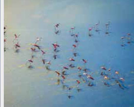
The photo, recorded through paraglider flight and released on July 19, 2023, show Maharlu Lake in south of Iran hosting hundreds of Flamingos and different species of birds.