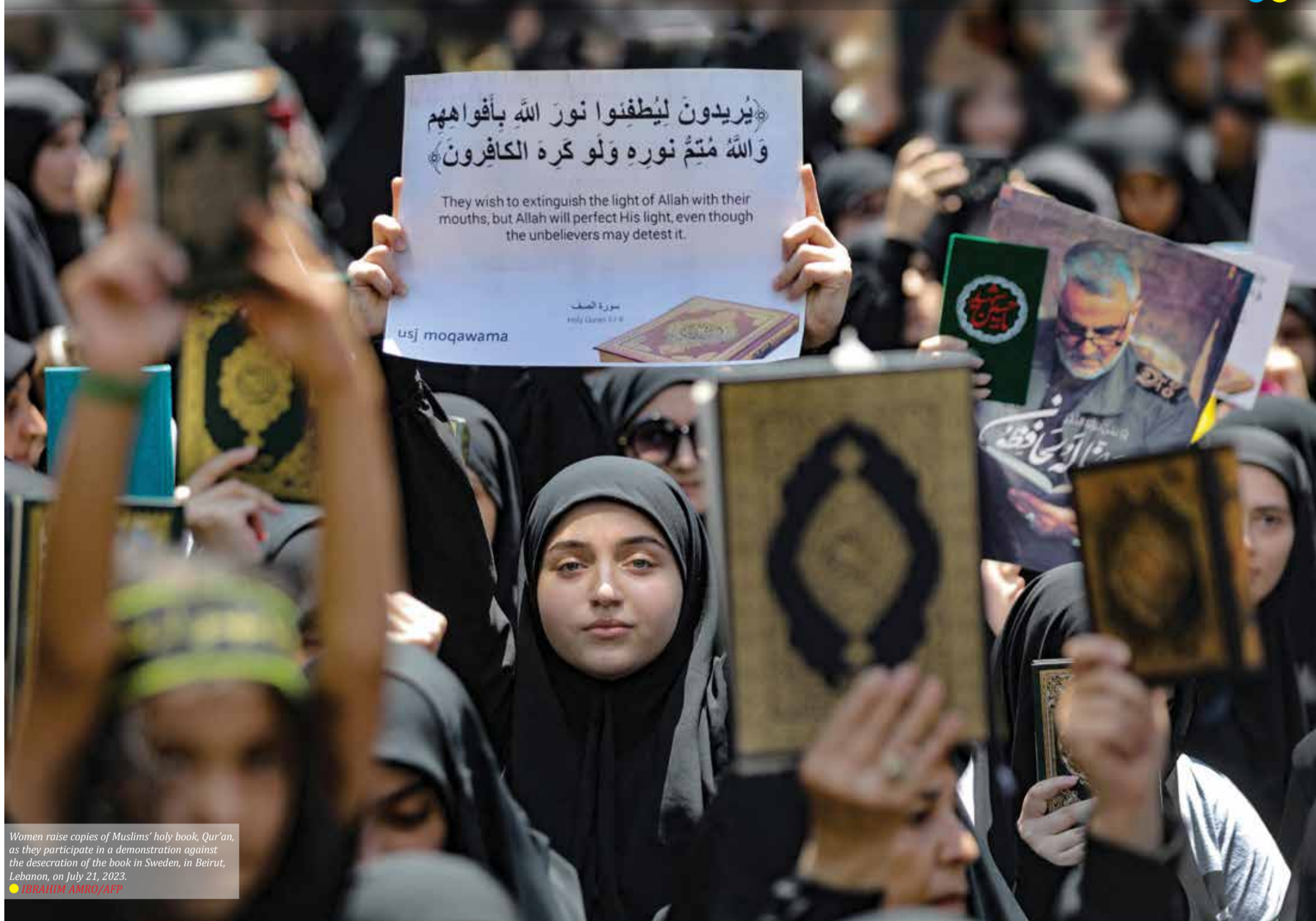
Women raise copies of Muslims' holy book, Qur'an, as they participate in a demonstration against the desecration of the book in Sweden, in Beirut, Lebanon, on July 21, 2023.

يُرِيدُونَ لِيُطْفِئُوا نُورَ اللَّهِ بِأَفْوَاهِهِمْ وَاللَّهُ مُتِمُّ نُورِهِ وَلَوْ كَرِهَ الْكَافِرُونَ They wish to extinguish the light of Allah with their mouths, but Allah will perfect His light, even though the unbelievers may detest it. سورة النور Holy Quran 24:17 usj moqawama