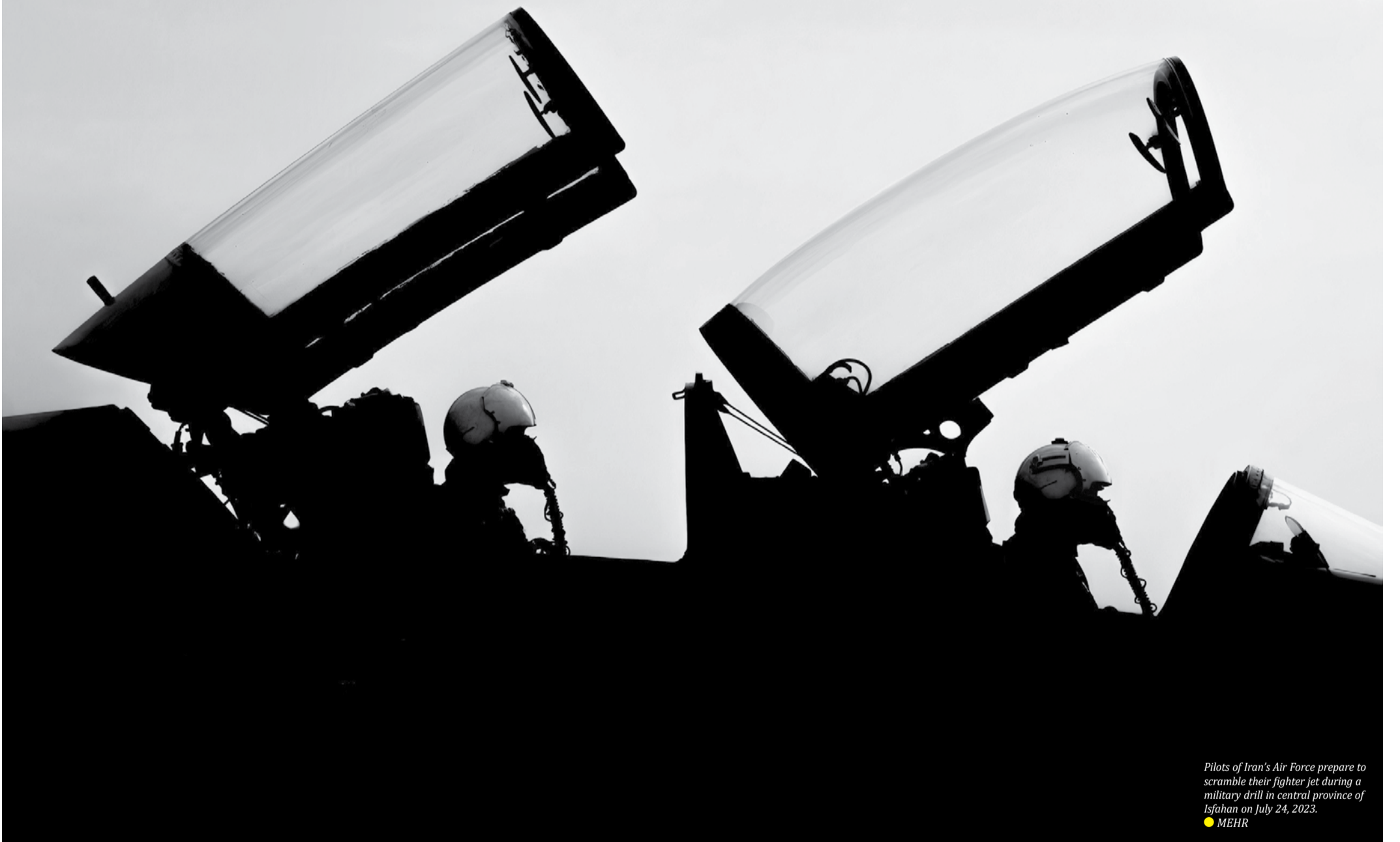
Pilots of Iran's Air Force prepare to scramble their fighter jet during a military drill in central province of Isfahan on July 24, 2023.