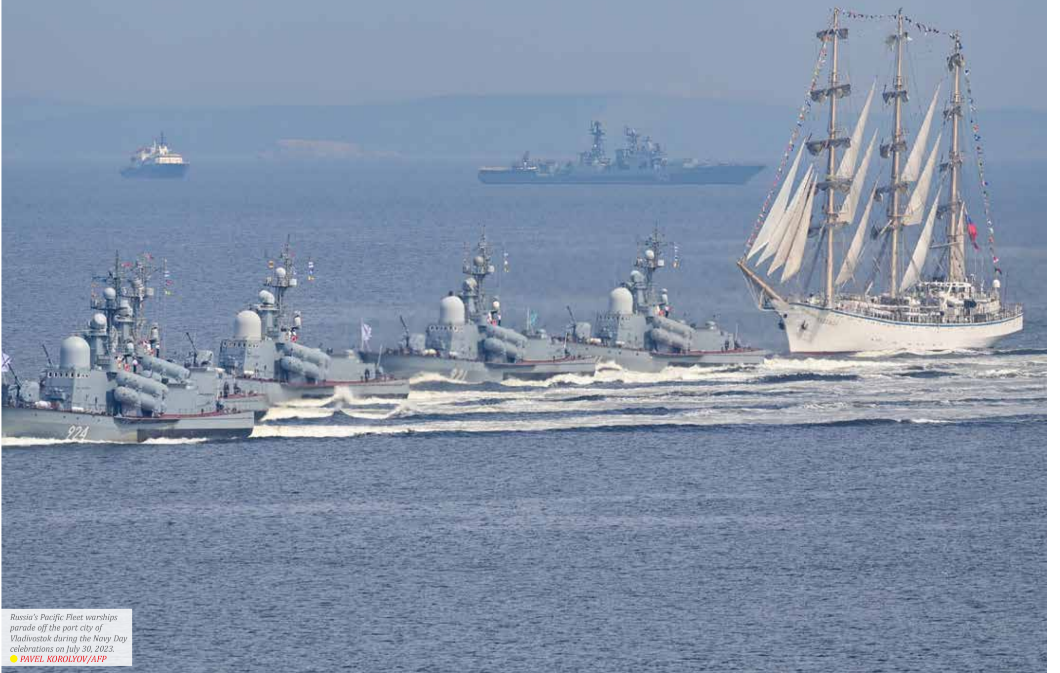
Russia's Pacific Fleet warships parade off the port city of Vladivostok during the Navy Day celebrations on July 30, 2023.