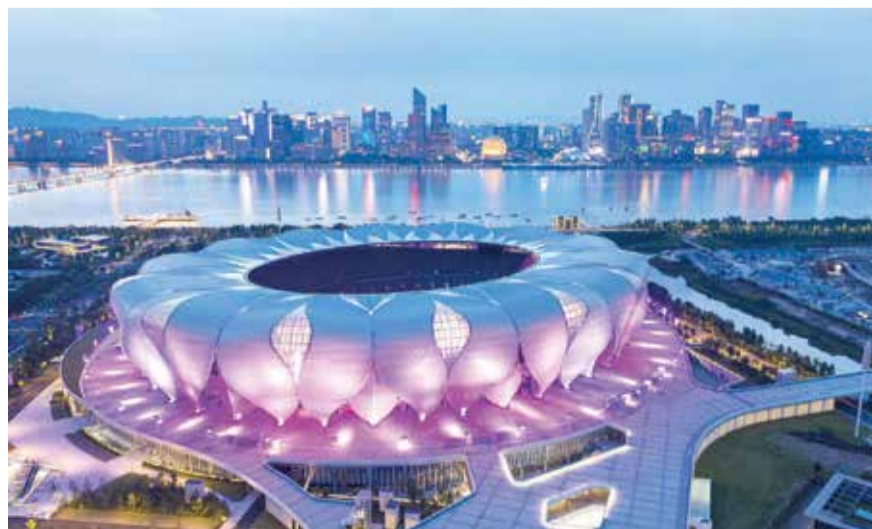
● The Hangzhou Olympic Sports Center Stadium is the main venue of the Hangzhou Asian Games.

REUTERS – China's Hangzhou city will stage the "greatest ever" Asian Games next month, acting Olympic Council of Asia head Randhir Singh told Reuters on Friday, asserting OCA's internal issues will not impact the continental event.