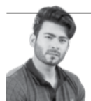
By Syed Ali Hassan Iran Daily's correspondent in Pakistan

The government of Pakistan has mortgaged the Islamabad International Airport for the Chinese loan. The government has signed an agreement approving the issuance of a sovereign guarantee worth $3 billion on Chinese debt. The outgoing Cabinet's Economic Coordination Committee (ECC) made this decision en route to transferring the call to the caretaker government for a decision on importing 1 million metric tons of wheat. After the ECC meeting, the