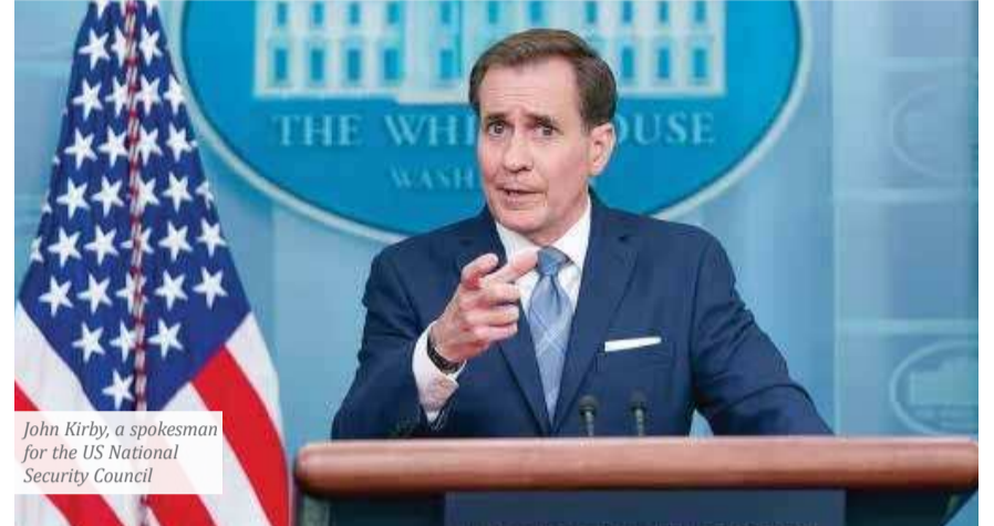
John Kirby, a spokesman for the US National Security Council

The New York Times had earlier reported that under the deal, the US will unfreeze nearly $6 billion