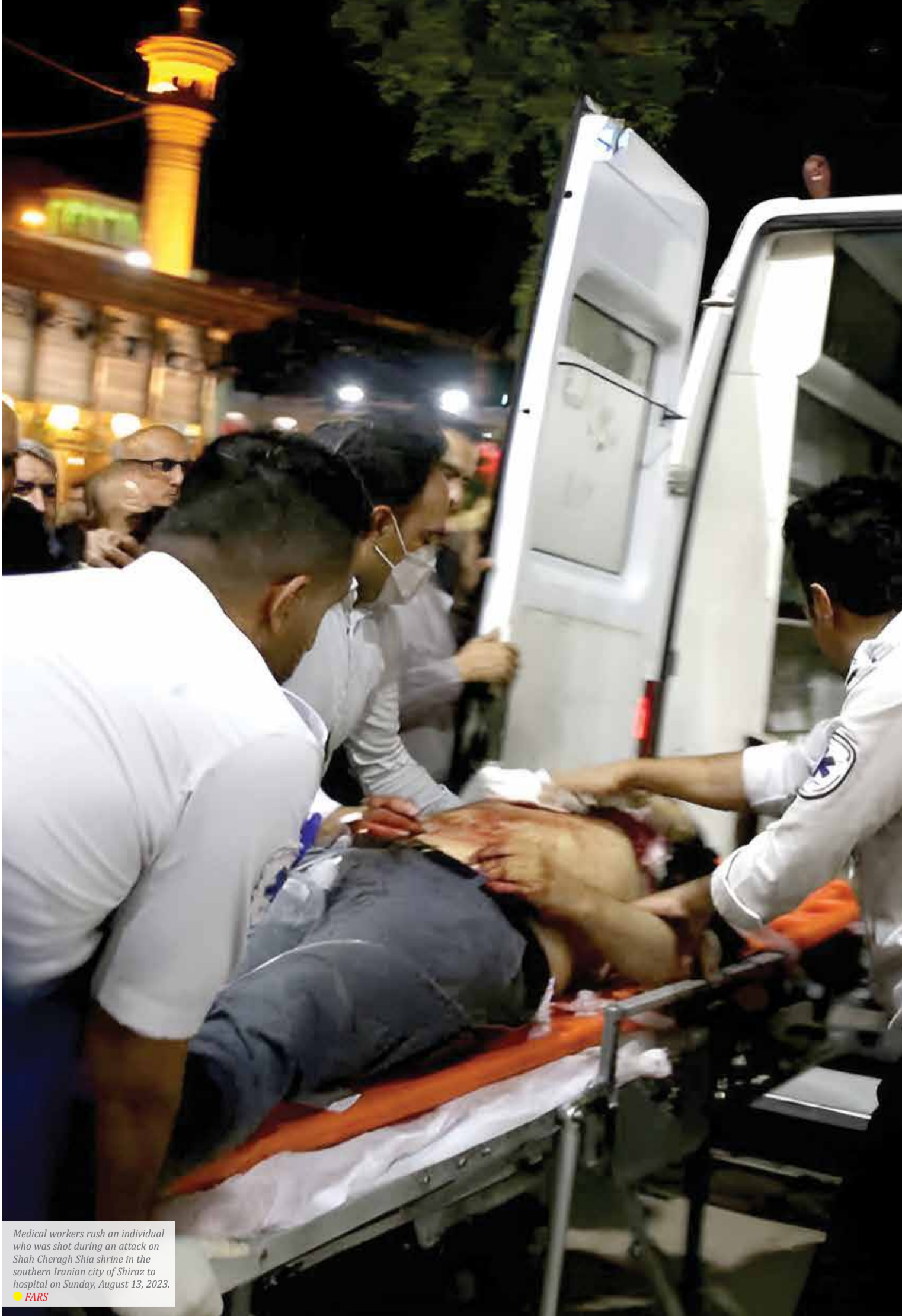
Medical workers rush an individual who was shot during an attack on Shah Cheragh Shia shrine in the southern Iranian city of Shiraz to hospital on Sunday, August 13, 2023.