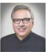
President Arif Alvi

I congratulate all my compatriots on Pakistan's 76th Independence Day anniversary. On this day, we pay tribute to the sacrifices rendered by our founding fathers and workers of the Pakistan Movement.