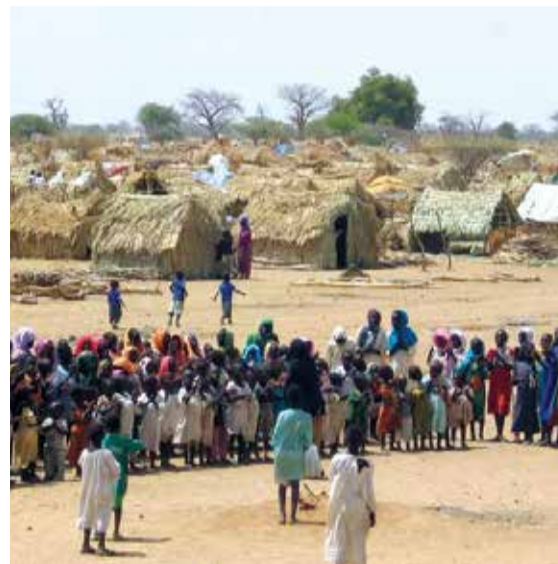
The Kakma camp, one of the largest in Darfur for people displaced during a nearly two-decade conflict in western Sudan, which began in 2003 and killed an estimated 300,000 people.

Violence flared in the western Sudanese city of Nyala and elsewhere in the state of South Darfur on Sunday, witnesses said, threatening to engulf the region in Sudan's protracted war. The conflict has brought daily battles to the streets of the capital of Khartoum, a revival of ethnically targeted attacks in West Darfur, and the displacement of more than 4 million people within Sudan and across its borders into Chad, Egypt, South Sudan and other countries, Reuters reported. Clashes between the Sudanese army and paramilitary Rapid Support Forces have flared periodically in Nyala, the country's second biggest city and a strategic hub for the fragile Darfur region. The latest flare-up has lasted three days, with both the army and RSF firing artillery into residential neighbourhoods, witnesses told Reuters. Fighting has damaged electricity, water, and telecoms networks. At least eight people were killed on Saturday alone, according to the Darfur Bar Association, a national human rights monitor. In recent days, fighting has extended 100 km (60 miles) to the west of Nyala, in the Kubum area, killing