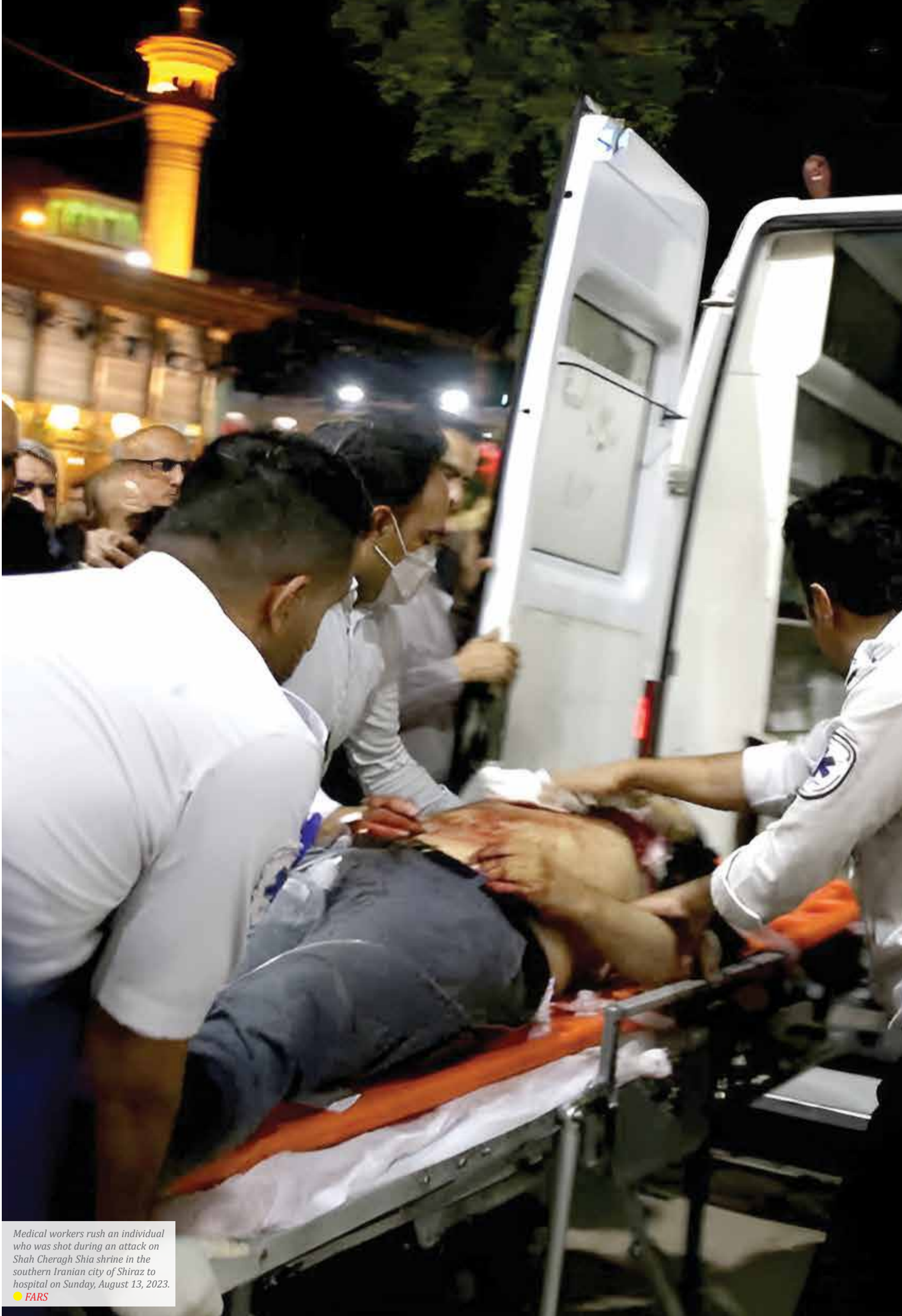
Medical workers rush an individual who was shot during an attack on Shah Cheragh Shia shrine in the southern Iranian city of Shiraz to hospital on Sunday, August 13, 2023.