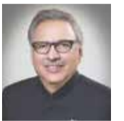
President Arif Alvi

The stories of those people, who faced hardships, endured oppression and braved immense challenges to reach Pakistan, serve as a source of inspiration for our future generations. We should value the sacrifices of our forefathers for the creation of Pakistan and work for the prosperity of our people. Page 5 >