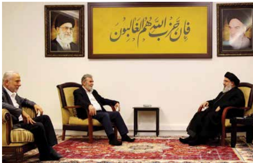
Secretary-General of Lebanon's Hezbollah resistance movement Sayyed Hassan Nasrallah (R) meets with Ziad al-Nakhleh (C), leader of the Palestinian Islamic Jihad resistance movement, in Beirut, Lebanon, on August 13, 2023.