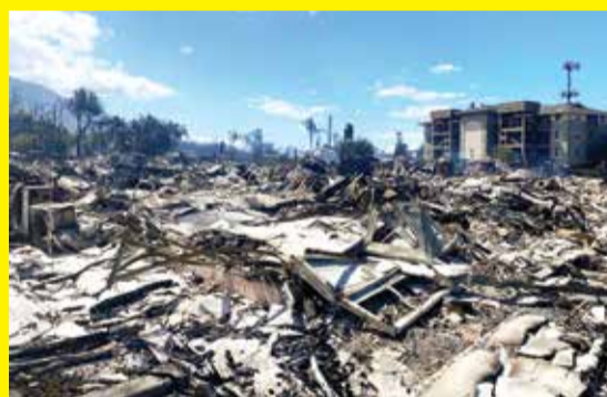
Destroyed buildings and homes are pictured in the aftermath of a wildfire in western Maui, US, on Aug. 11, 2023.

according to the National Fire Protection Association. Losses are estimated to be approaching $6 billion, after roughly 2,200 structures were destroyed in West Maui across the 2,170 acres burned by the blaze. Only two of the 89 people killed have been identified so far, Police Chief John Pelletier said. Efforts to identify the dead were complicated by the ferocity of the blaze, which melted metal and