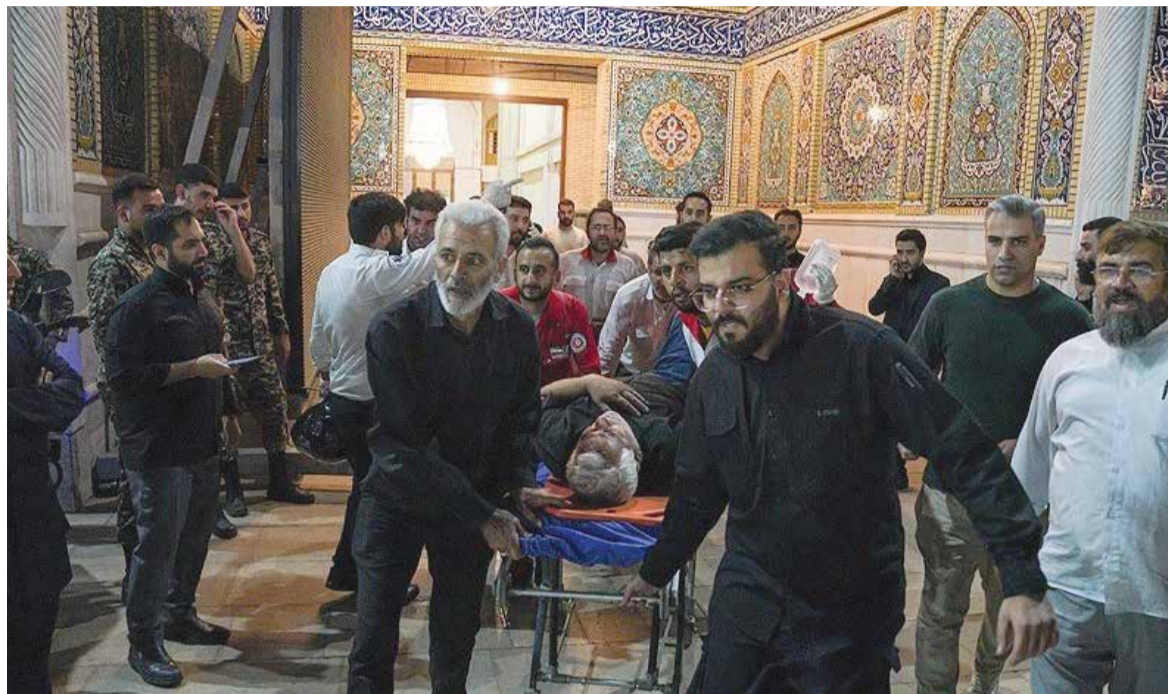
People help the medical staff rush an individual injured during the terrorist attack on Shah Cheragh Shrine in Shiraz, southern Iran, to hospital on August 13, 2023.