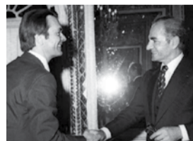
Iran's ousted Shah Mohammad Reza Pahlavi (R) and David Owen

THE GUARDIAN – David Owen, a former British foreign secretary, said the UK should finally acknowledge its leading role in the 1953 coup that toppled the democratically-elected government of Iranian Prime Minister Mohammad Mosaddeq. The US formally admitted its role 10 years ago with the declassification of a large volume of intelligence documents, which made clear that the ousting of Mosaddeq 70 years ago this week was a joint CIA-MI6 endeavour.