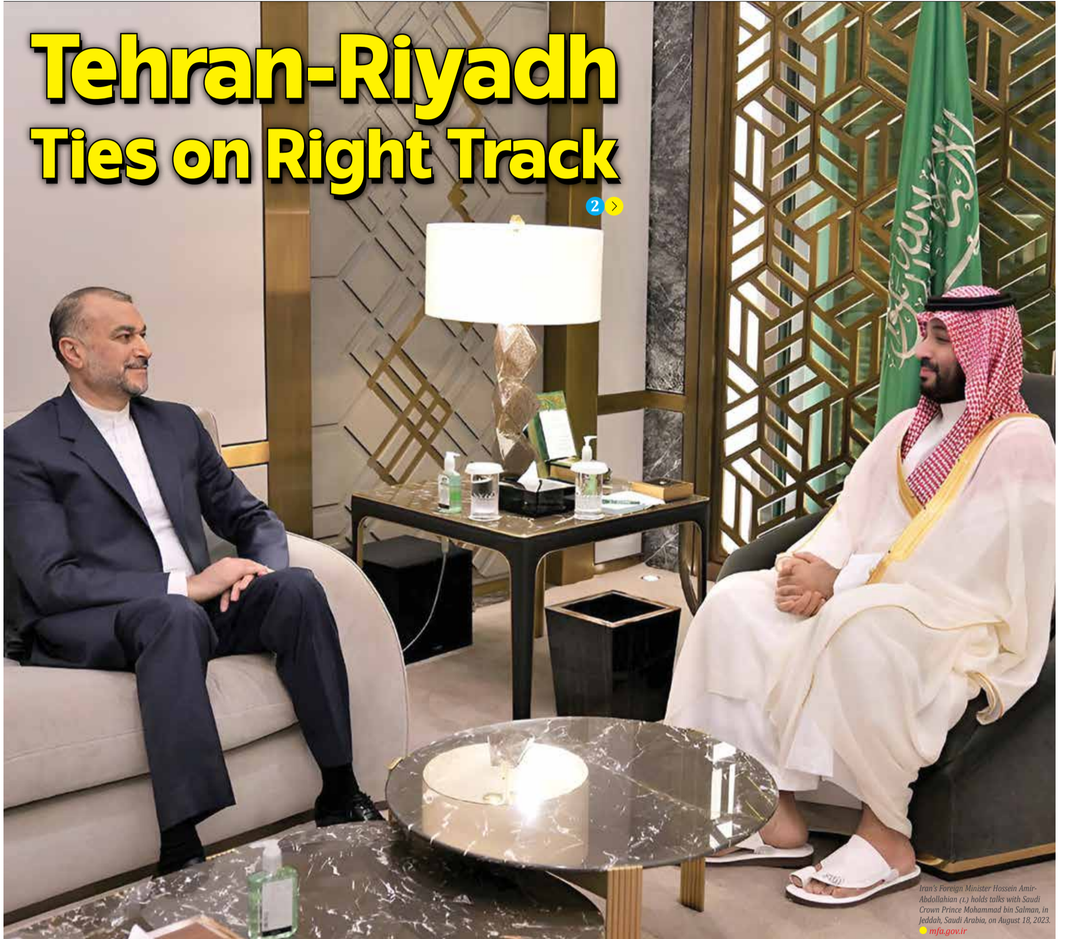
Iran's Foreign Minister Hossein Amir-Abdollahian (L.) holds talks with Saudi Crown Prince Mohammed bin Salman, in Jeddah, Saudi Arabia, on August 18, 2023.