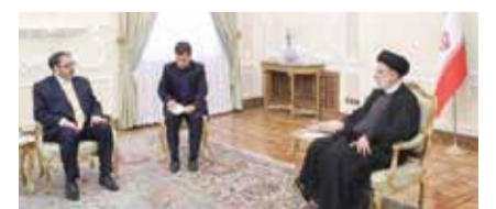
Iranian President Ebrahim Raeisi (R) and the new ambassador of Peru to Tehran (L)

The ambassador of Ecuador noted, "The two countries have very good capacities for interaction with each other, and Ecuador is interested in cooperating in the fields of medicine, industry, technology, and science with Iran."