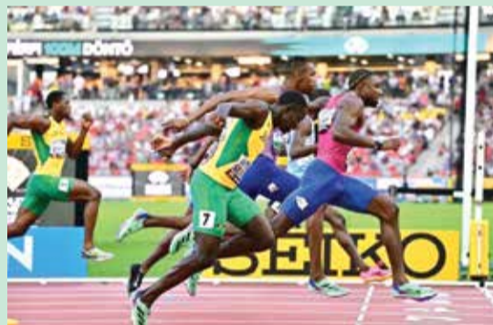
✓ American Noah Lyles (R) crosses the line to win the men's 100m final at the World Athletics Championships in Budapest, Hungary, on August 20, 2023.

REUTERS – Since his retirement in 2017, athletics has routinely asked “where is the new Usain Bolt?” but newly-minted world 100 metres champion Noah Lyles is doing his best on and off the track to bring his sport firmly into the public limelight.