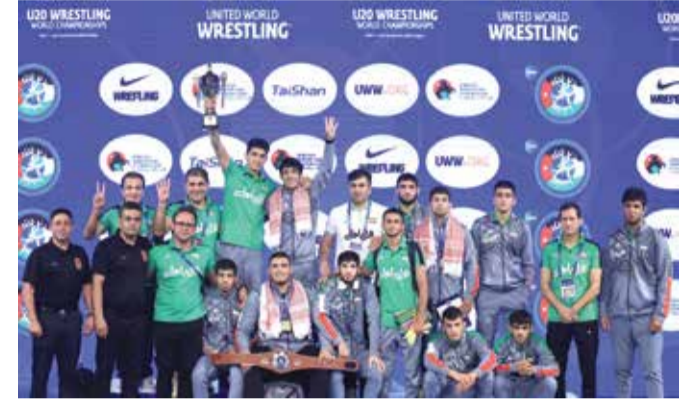
✓ The Iranian team and coaching staff pose with the Greco-Roman trophy at the Wrestling U20 World Championships in Amman, Jordan, on August 20, 2023.