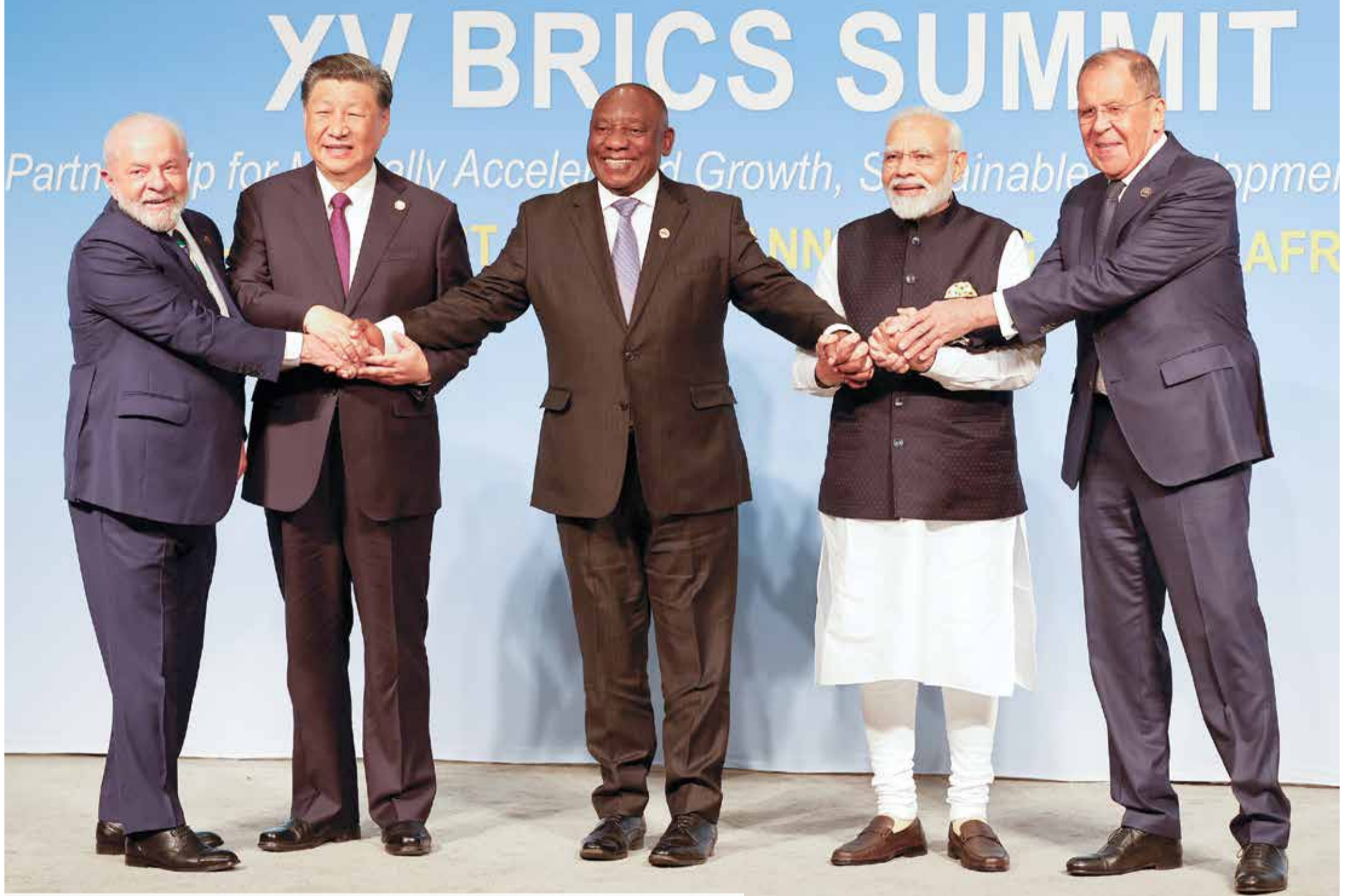
Brazil's President Luiz Inacio Lula da Silva (1), President of China Xi Jinping (2nd L), South African President Cyril Ramaphosa (C), Prime Minister of India Narendra Modi (2nd R) and Russia's Foreign Minister Sergei Lavrov (R) pose for a family photo during the 2023 BRICS Summit in Johannesburg on August 23, 2023.