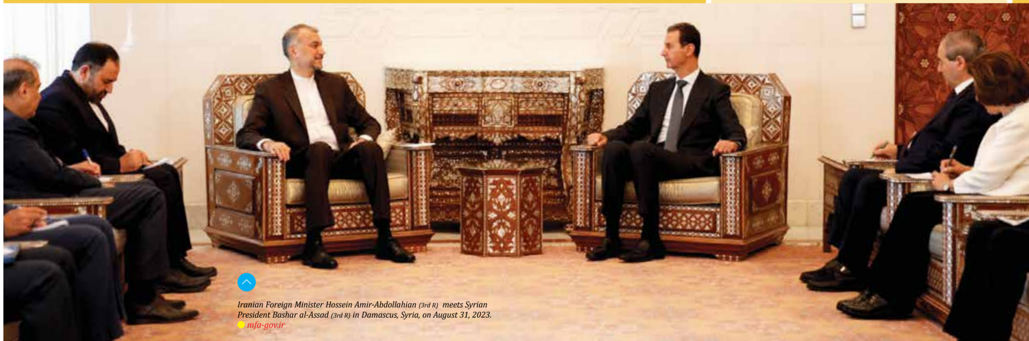
Iranian Foreign Minister Hossein Amir-Abdollahian (3rd R) meets Syrian President Bashar al-Assad (3rd R) in Damascus, Syria, on August 31, 2023.

Iran's Foreign Minister Hossein Amir-Abdollahian held talks with top Syrian and Lebanese officials on Thursday and Friday to reiterate the Islamic Republic's unwavering support for the two important countries in the Middle East. During a three-day visit to Syria and Lebanon, Iran's top diplomat and the officials from the two Arab countries discussed many issues including developments in the region, problems facing the two Arab countries, as well as relations between Tehran and Damascus and Beirut in different fields, especially in the economy.