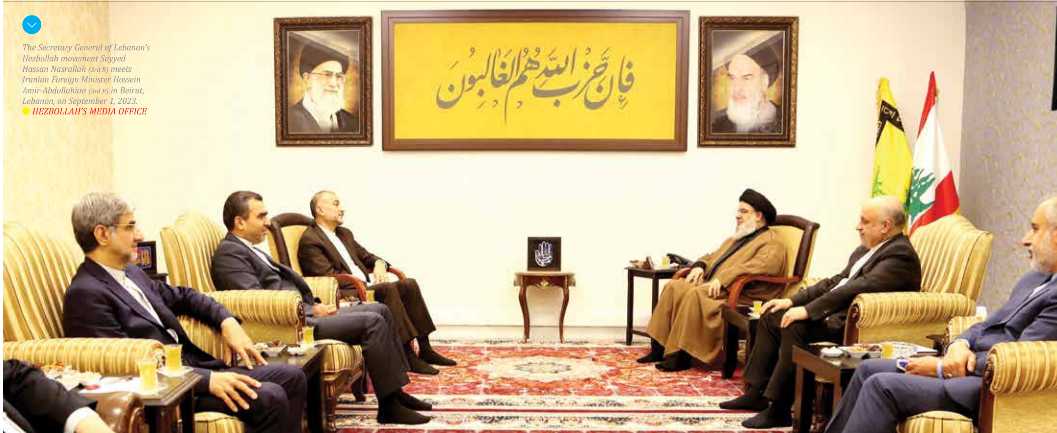
The Secretary General of Lebanon's Hezbollah movement Sayyed Hassan Nasrallah (3rd R) meets Iranian Foreign Minister Hossein Amir-Abdollahian (3rd R) in Beirut, Lebanon, on September 1, 2023.

Vol. 7378 • Saturday, September 2, 2023 • Shahrivar 11, 1402 • Safar 16, 1445 • Price 40,000 Rials • 8 Pages