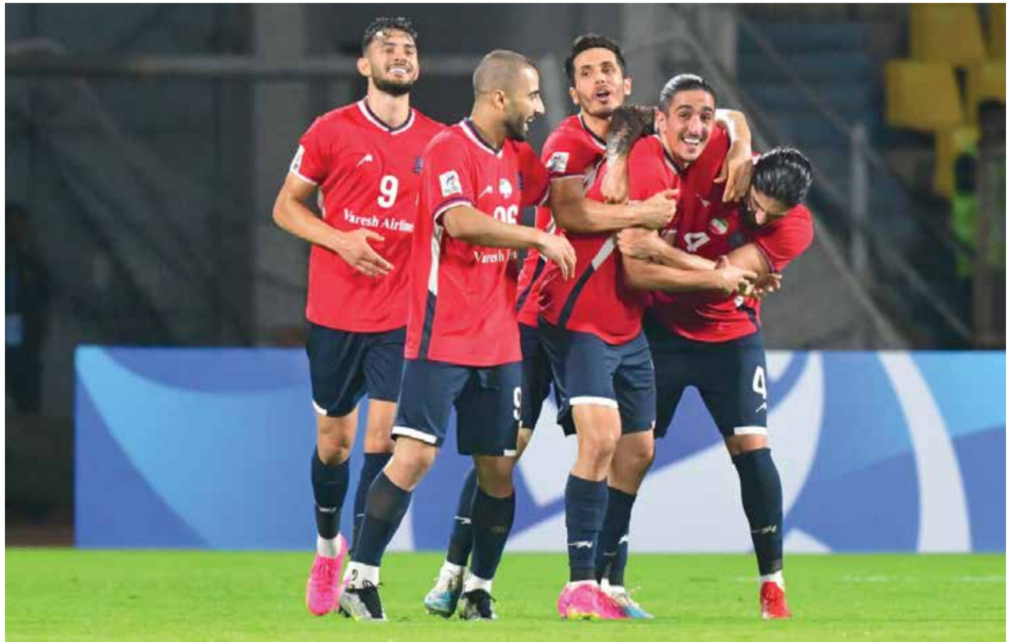
Nassaji Mazandaran players celebrate a goal during a 2-0 victory over Mumbai City in the AFC Champions League group stage at the Balewadi Stadium, Pune, India, on September 18, 2023.