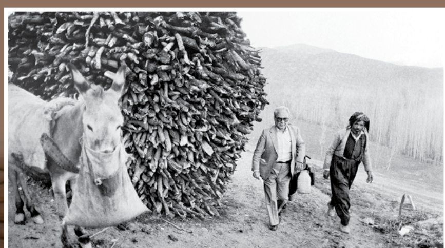
The visit of Secretary-General of the United Nations Perez de Cuellar following chemical bombings by Iraq on Iran's Kurdish city of Sardasht, Kurdistan Province in April 1988.