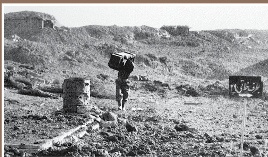
Transport and distribution of supplies to individual combat posts in Operation Karbala 5, eastern Basra, Iraq, in December 1986.