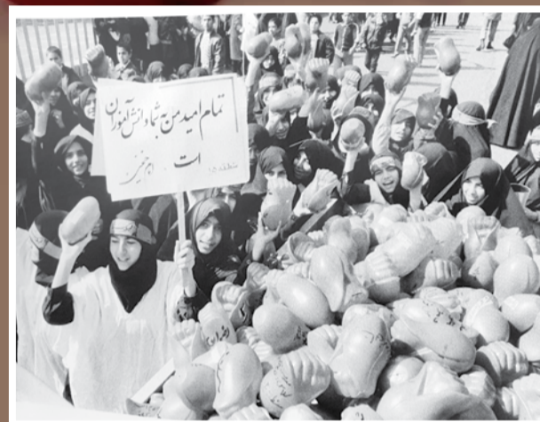
Donation of students' savings piggy banks as a symbolic support for the continued defense against Iraq's aggression, Mofateh Street, Tehran, in February 1987.