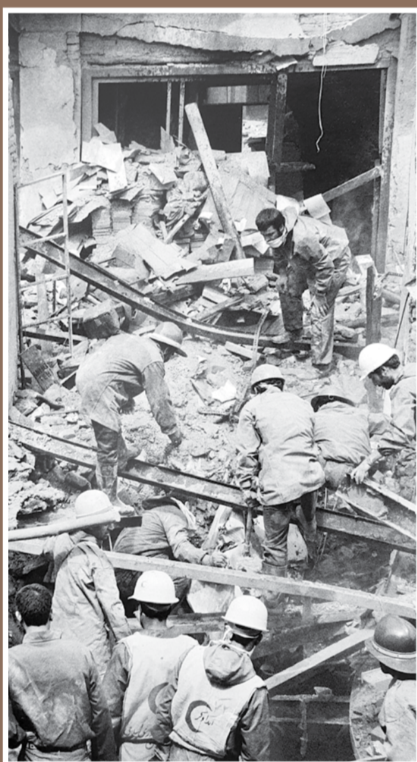
A rescue team looks for victims of an Iraqi missile attack which hit the Naser Khosrow Street in Tehran, Iran, in April 1988.