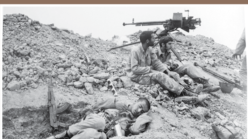
Rest and preparedness for a potential Iraqi attack, eastern Basra, Iraq, in December 1986.