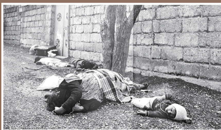
The photo shows chemical attacks on the defenseless people of the Iraqi city of Halabja by the Iraqi army in March 1988.