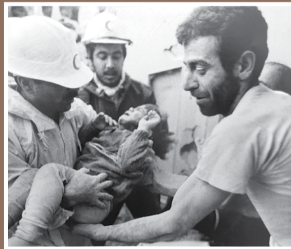
⤴ The transfer of a child injured in an Iraq's missile attack to medical facilities in Tehran, Iran, in March 1988