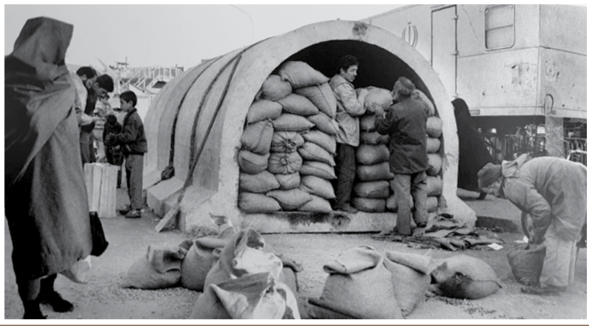
⤴ The construction and establishment of shelters on streets to protect people from Iraq's missile attacks in Tehran's Imam Hussein Square in March 1988