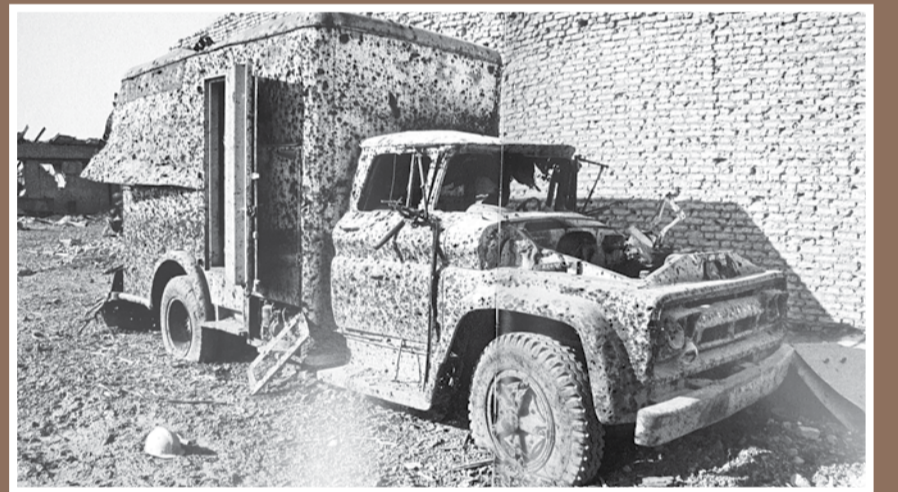
⤴ Evidence of the aftermath of and Iraqi army's invasion in Iran's city of Khorramshahr, in July 1982