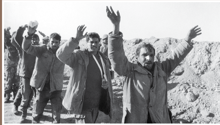
⤴ The transfer of Iraqi prisoners of war to the support line of Operation Karbala 5 in eastern Basra, Iraq, in December 1986