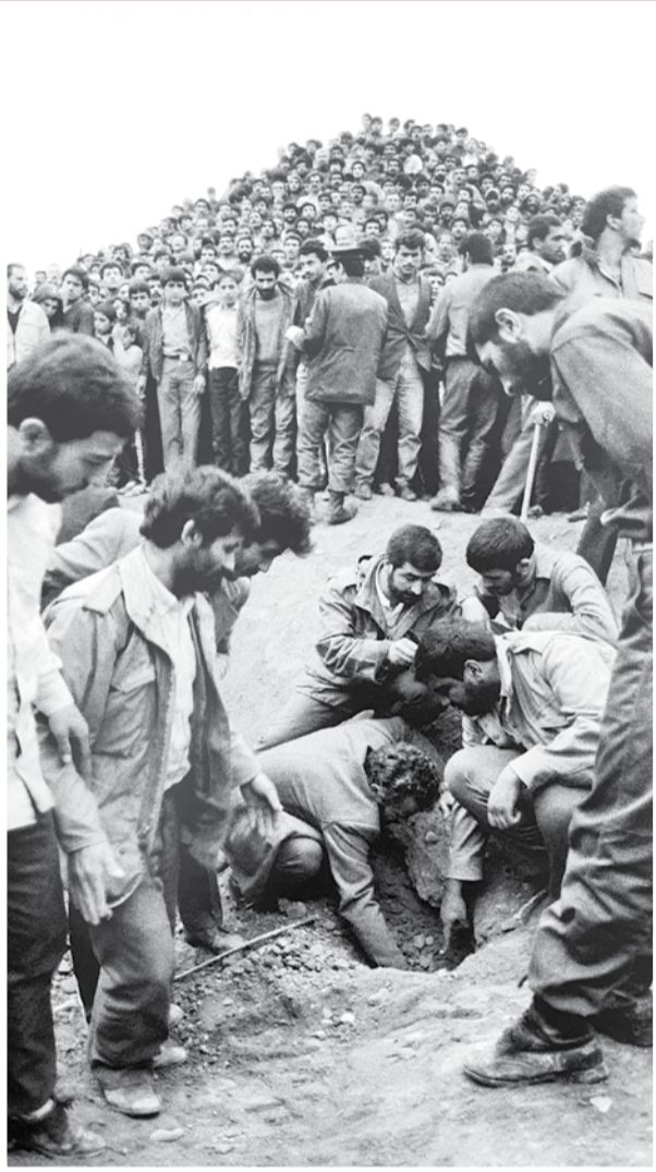
⤴ The discovery of unexploded missile remnants after Iraq's strikes on residential areas in Tehran's Afsarieh neighborhood in 1988.