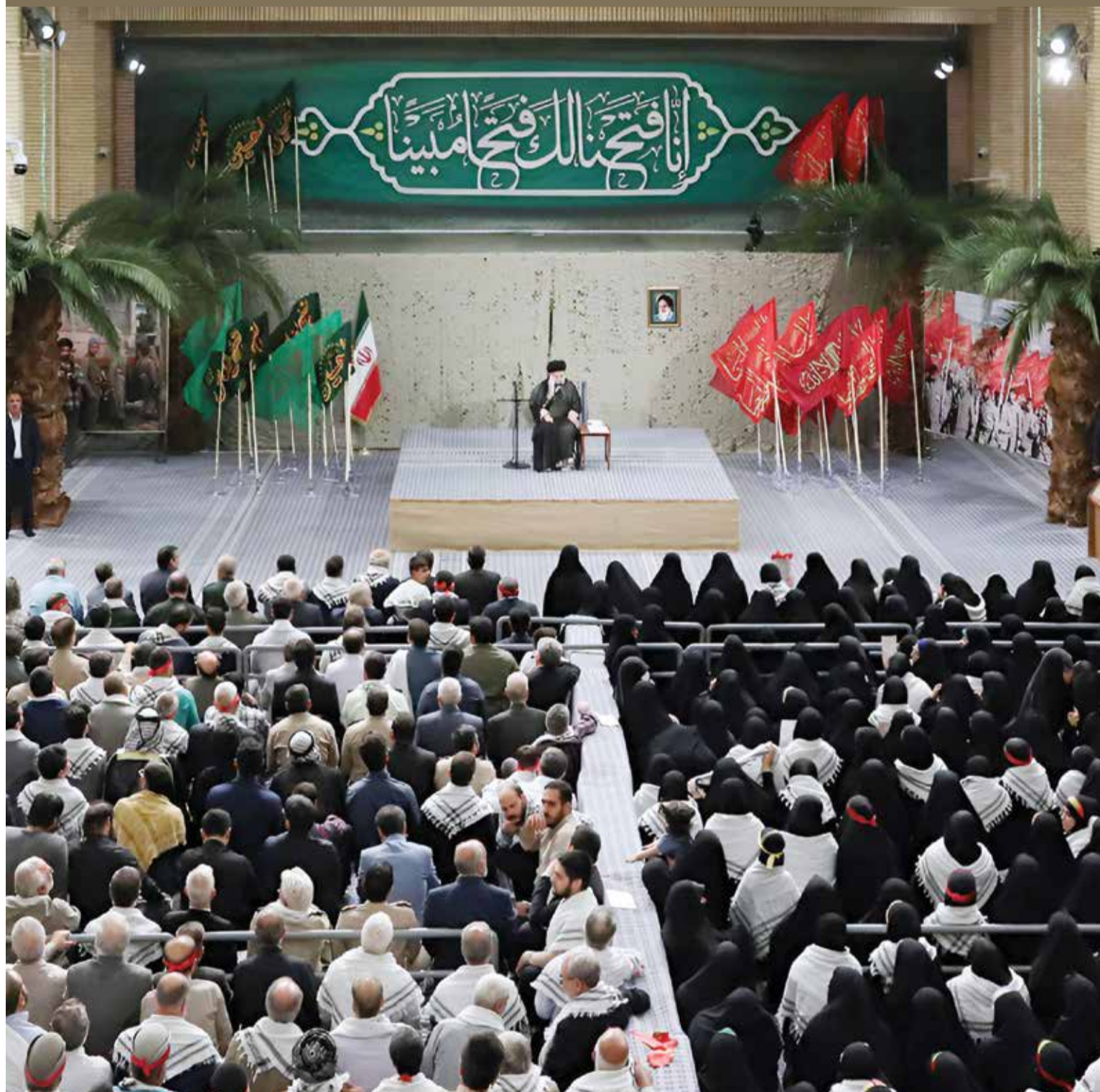
Leader of the Islamic Revolution Ayatollah Seyyed Ali Khamenei addresses a group of war veterans and promoters of resistance in Tehran on Sept. 20, 2023.

Leader of the Islamic Revolution Ayatollah Seyyed Ali Khamenei called the expansion of Iran's borders of resistance as one of the achievements of the "The Holy Defense" of the Iranian nation during eight years of Iraq's imposed war on Iran. "I don't mean geographical borders; we are not after that. It ex-