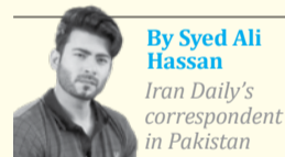
By Syed Ali Hassan Iran Daily's correspondent in Pakistan

The 17th IranPlast International Exhibition recently held in Tehran has played a crucial role in introducing Iran's plastic industry to countries in the region. According to businesspeople from around the world and neighboring countries, Iran's plastic industry has made significant progress in the last years in terms of raw material production. Setting up a plastic production industry in Iran is seen as a profitable investment. As Iran produces various raw materials for the plastic industry, Iranian policymakers have restricted the export of raw materials but are encouraging the export of value-added products. Any mechanism adopted