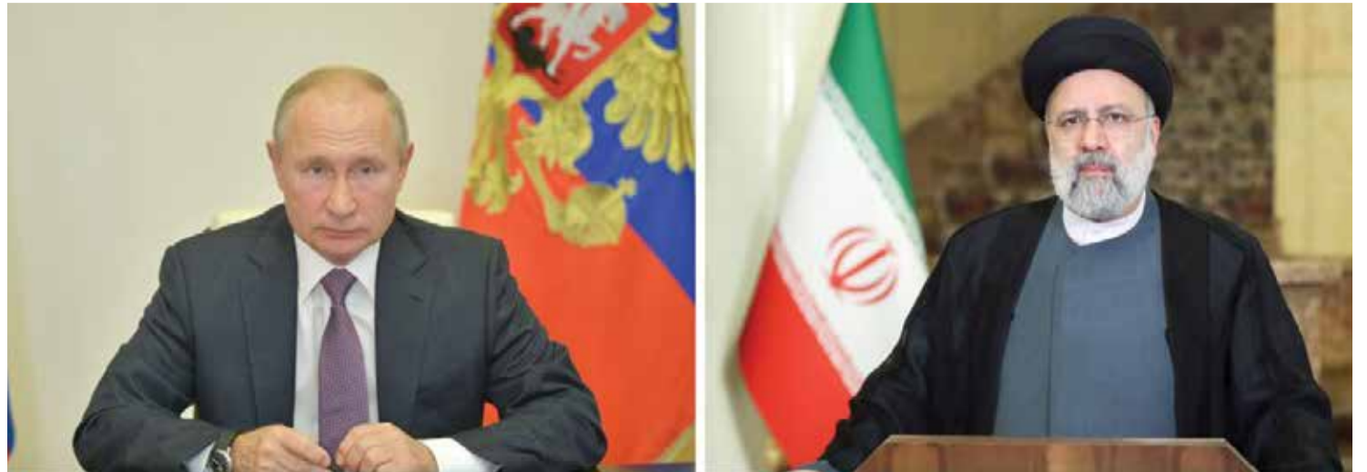
Iranian President Ebrahim Raeisi (R) and his Russian counterpart Vladimir Putin held a telephone conversation on September 26, 2023.

Iranian President Ebrahim Raeisi and his Russian counterpart Vladimir Putin discussed steps to ensure that Tehran fully takes part in BRICS activities as well as the situation around Nagorno-Karabakh and the normalization of Armenia-Azerbaijan relations. The Kremlin announced on Tuesday that the Russian and Iranian presidents held a telephone conversation on Tuesday at the initiative