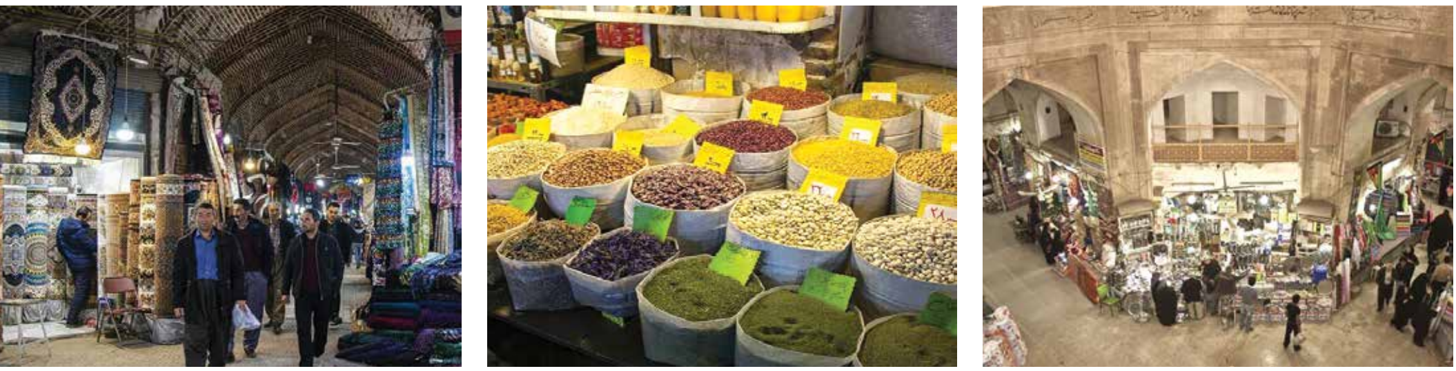
🗕 FARS/ALI ARSALANI

The bazaar also has several rastehs (covered alleys with shops and workshops of a particular trade) including knife makers, goldsmiths, carpet sell-