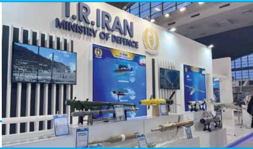
The photo shows Iranian anti-tank missiles and the M-6 UAV displayed at 11th International Armament and Military Equipment Fair Partner 2023 in Belgrade, Serbia, on September 26, 2023.