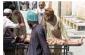
Volunteers carry a victim of a suicide bombing on a stretcher at a hospital in Quetta, Balochistan Province, Pakistan, on September 29, 2023.

international community, especially Islamic countries, to seriously react to this criminal act and prevent the repetition of such tragic events. At least 57 people were killed and more than 60 others were injured after suicide bombings ripped through two mosques in Pakistan, police and health officials said. No group has claimed responsibility for the blasts, one of which trapped dozens of people under rubble, media said, according to Reuters. The first blast, in the southwestern province of Balochistan, killed 52 people, according to a district health official, Abdul Rasheed. "The bomber detonated