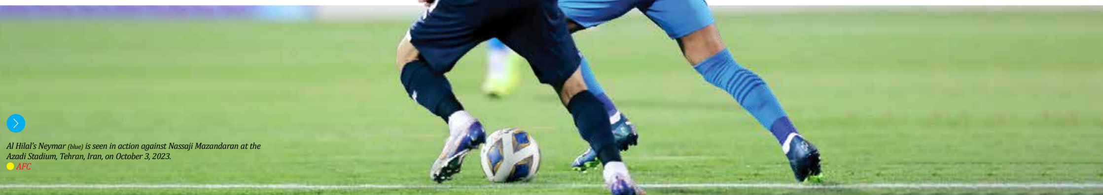
▶ Al Hilal's Neymar (blue) is seen in action against Nassaji Mazandaran at the Azadi Stadium, Tehran, Iran, on October 3, 2023.