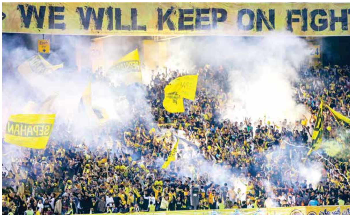
▶ Sepahan fans are seen in the stands at the Naqsh-e Jahan Stadium, Isfahan, Iran, on October 2, 2023.

"due to unanticipated and unforeseen circumstances," adding: "This matter will now be referred to the relevant committees." Several sources, including the Iranian Fars and Tasnim new agencies, reported that the players of the Saudi side refused to leave the dressing room due to a bust of Iranian Quds Force General Qassem Soleimani, who was assassinated in a US drone strike in Baghdad in January 2020, being placed at the entrance to the pitch.