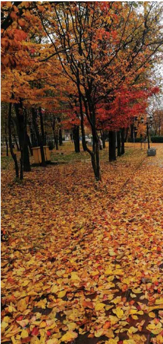
Mohtasham Garden