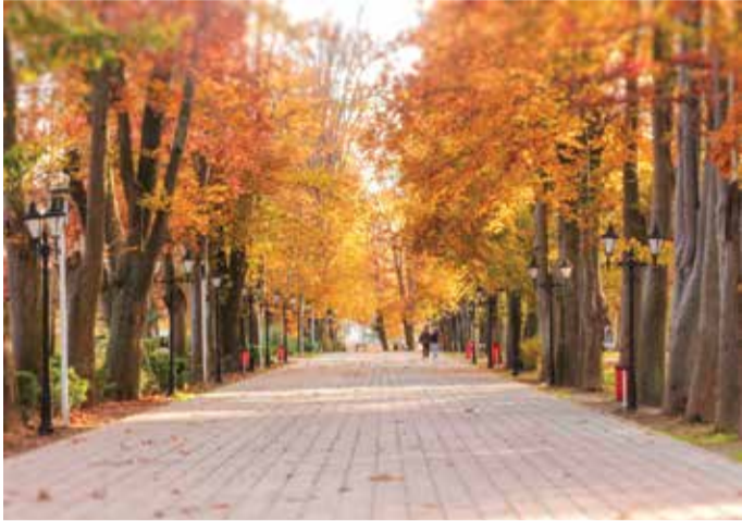
Mohtasham Garden ealiya.com

Nature meets cultural splendor in rain city