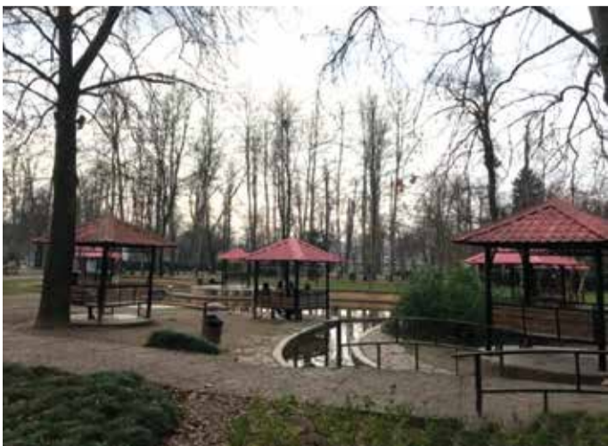
Mohtasham Garden lastsecond.ir

Rasht is the capital of Gilan Province. It is one of the most beautiful cities in Iran. This city is the largest and most populous city on the southern shores of the Caspian Sea. The seashore is about 25 kilometers from the city. If you are planning to travel to this vibrant city, one of the places you should visit is Mohtasham Garden.