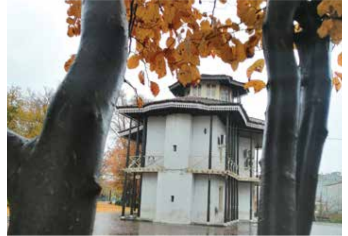
Kolah Farangi Mansion

Situated in the heart of Rasht, this remarkable park welcomes visitors all year round, providing an opportunity to relish the distinct allure of each passing season. However, it is worth noting that Rasht has earned the nickname "Rain City" due to its frequent rainfall, especially during the colder months. To ensure a pleasant and gratifying visit, we highly recommend checking the weather forecast in advance. This way, you can equip yourself with suitable attire and prepare for a comfortable and delightful experience. Rasht presents a captivating array of experiences that are bound to delight you in every way. From awe-inspiring natural landscapes to captivating historical sites, the city has it all. And let's not forget about the irresistible gastronomy that Rasht proudly offers. Additionally, within close proximity, you'll find enchanting attractions like Shahr-dari Square, Rasht Grand Bazaar, and the Gilan Rural Heritage Museum, each offering its own unique charm and cultural significance.