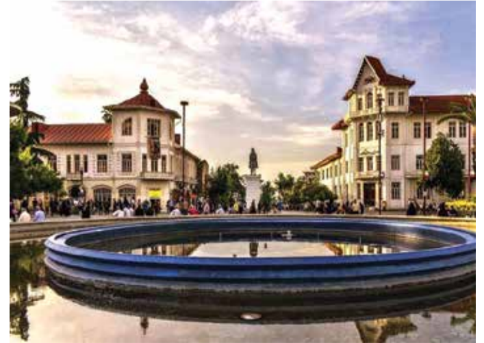
Shahr-dari Square