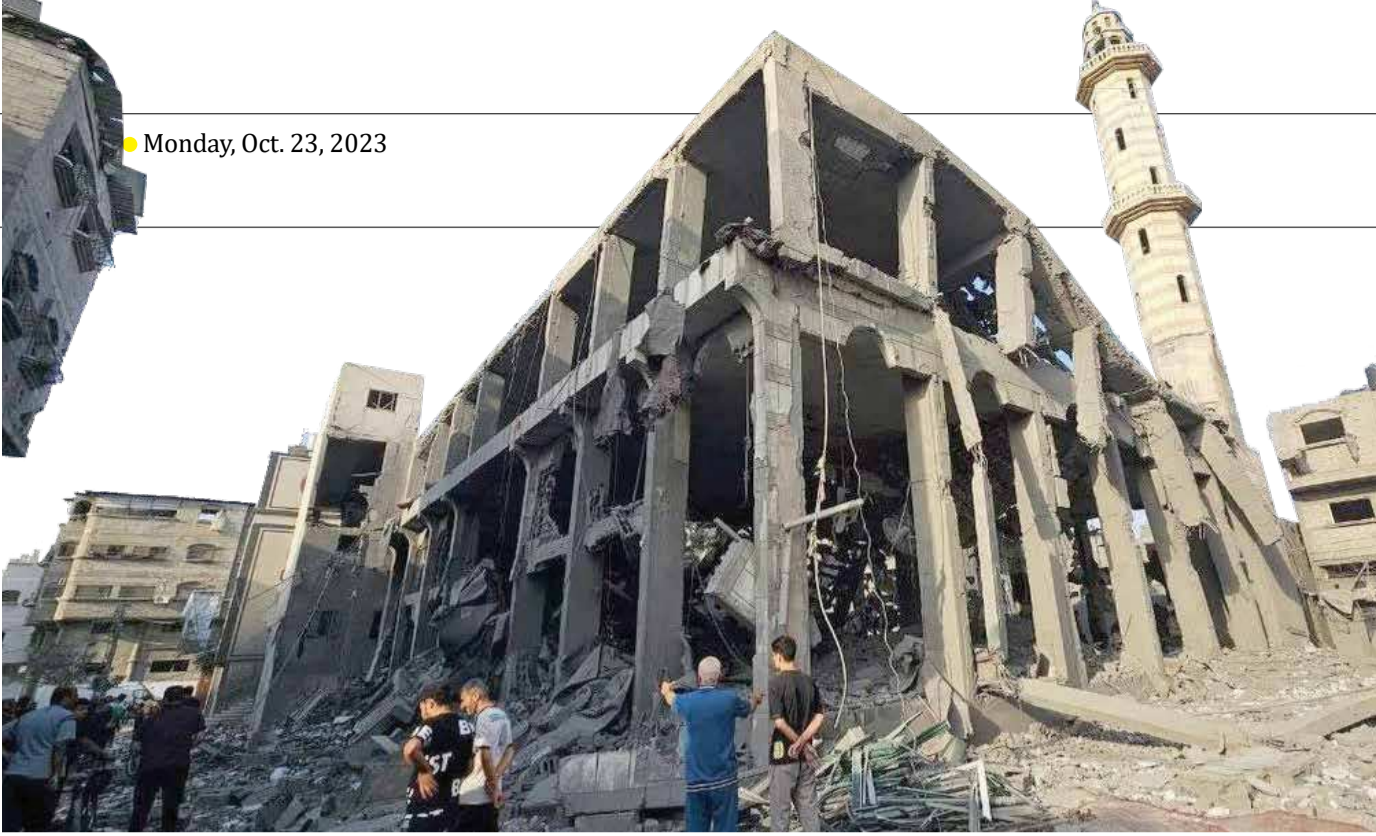
Palestinians gather around the remains of a mosque destroyed in Israeli strikes, as the conflict between Israel and Palestinian resistance group Hamas continues, in the northern Gaza Strip, on October 22, 2023.