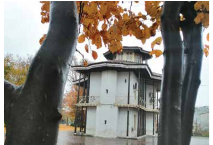
Kolah Farangi Mansion

Situated in the heart of Rasht, this remarkable park welcomes visitors all year round, providing an opportunity to relish the distinct allure of each passing season. However, it is worth noting that Rasht has earned the nickname "Rain City" due to its frequent rainfall, especially during the colder months. To ensure a pleasant and gratifying visit, we highly recommend checking the weather forecast in advance. This way, you can equip yourself with suitable attire and prepare for a comfortable and delightful experience. Rasht presents a captivating array of experiences that are bound to delight you in every way. From awe-inspiring natural landscapes to captivating historical sites, the city has it all. And let's not forget about the irresistible gastronomy that Rasht proudly offers. Additionally, within close proximity, you'll find enchanting attractions like Shahr-dari Square, Rasht Grand Bazaar, and the Gilan Rural Heritage Museum, each offering its own unique charm and cultural significance.