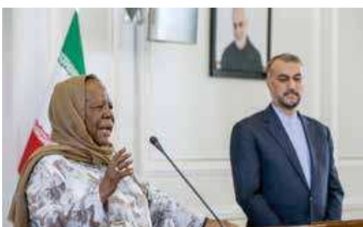
South Africa Naledi Pandor Foreign Minister (L) speaks during a joint press conference with his Iranian counterpart Hossein Amir-Abdollahian in Tehran on October 22, 2023.