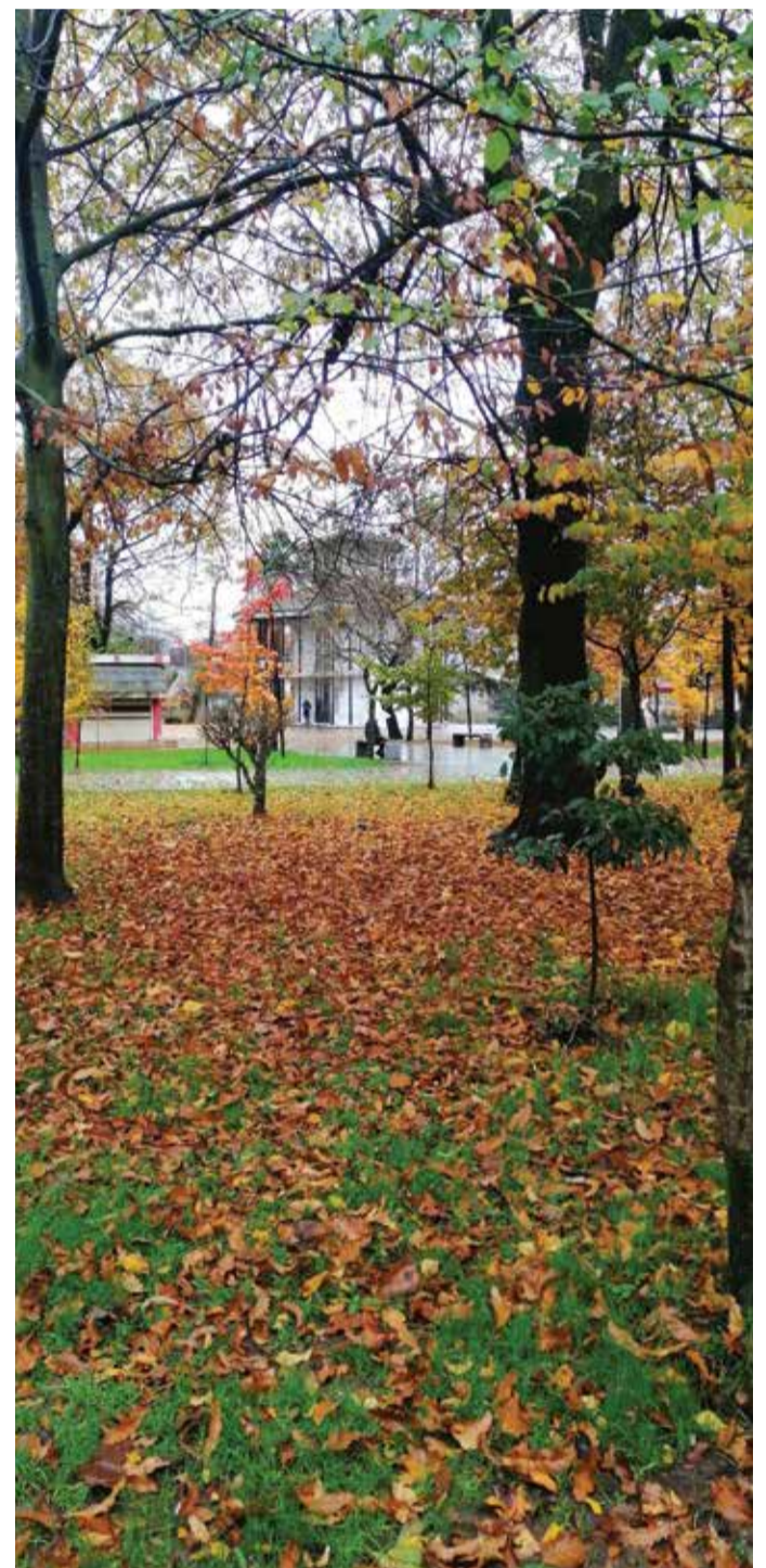
Mohtasham Garden rokna.net