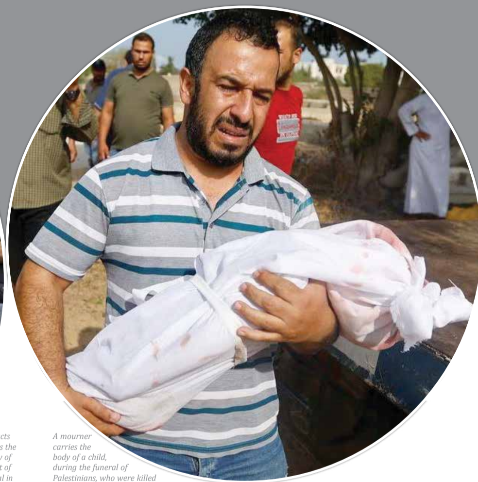
A mourner carries the body of a child, during the funeral of Palestinians, who were killed in Israeli strikes, in Khan Younis in the southern Gaza Strip, on October 22, 2023.