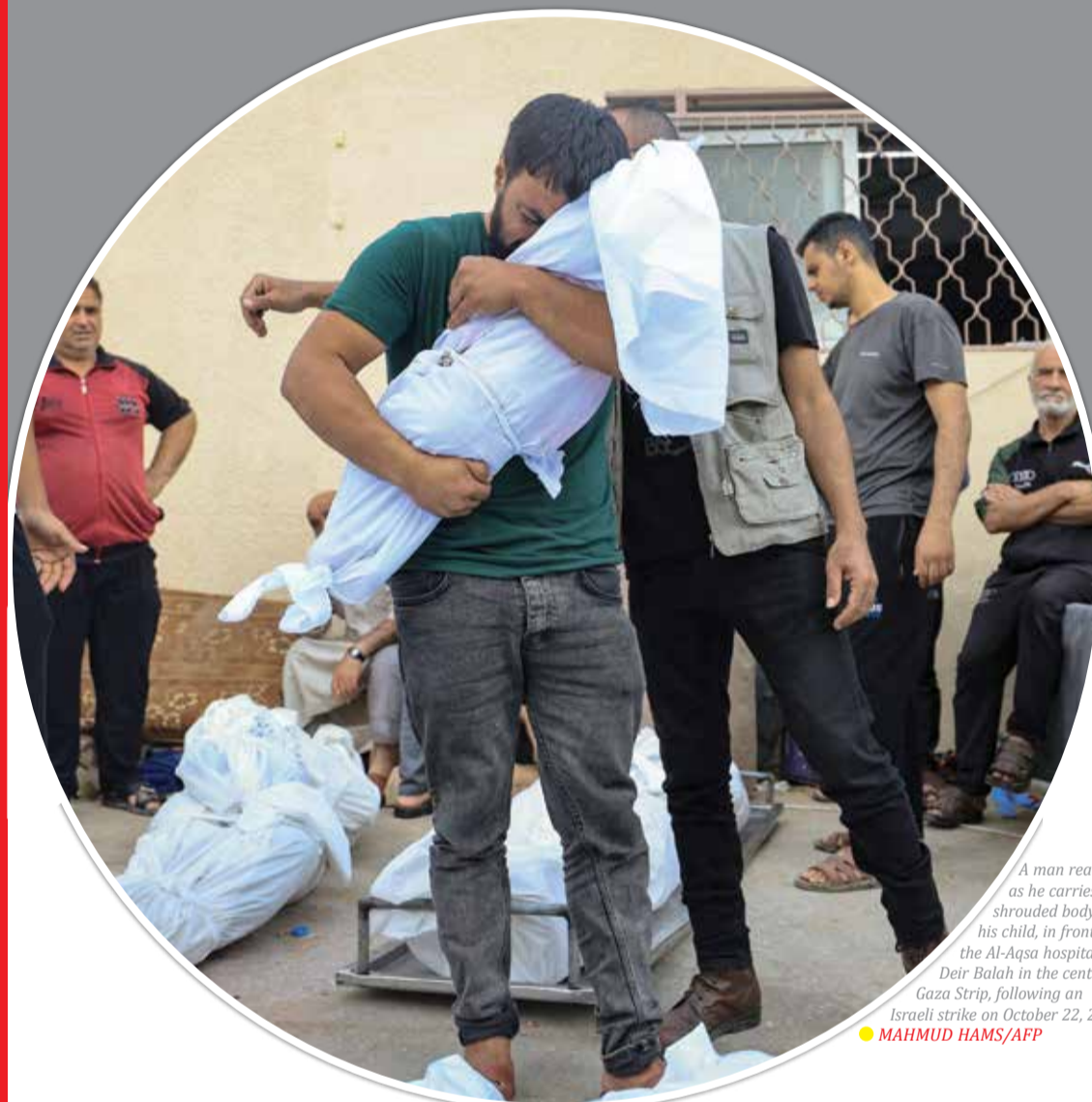
A man reacts as he carries the shrouded body of his child, in front of the Al-Aqsa hospital in Deir Balah in the central Gaza Strip, following an Israeli strike on October 22, 2023.