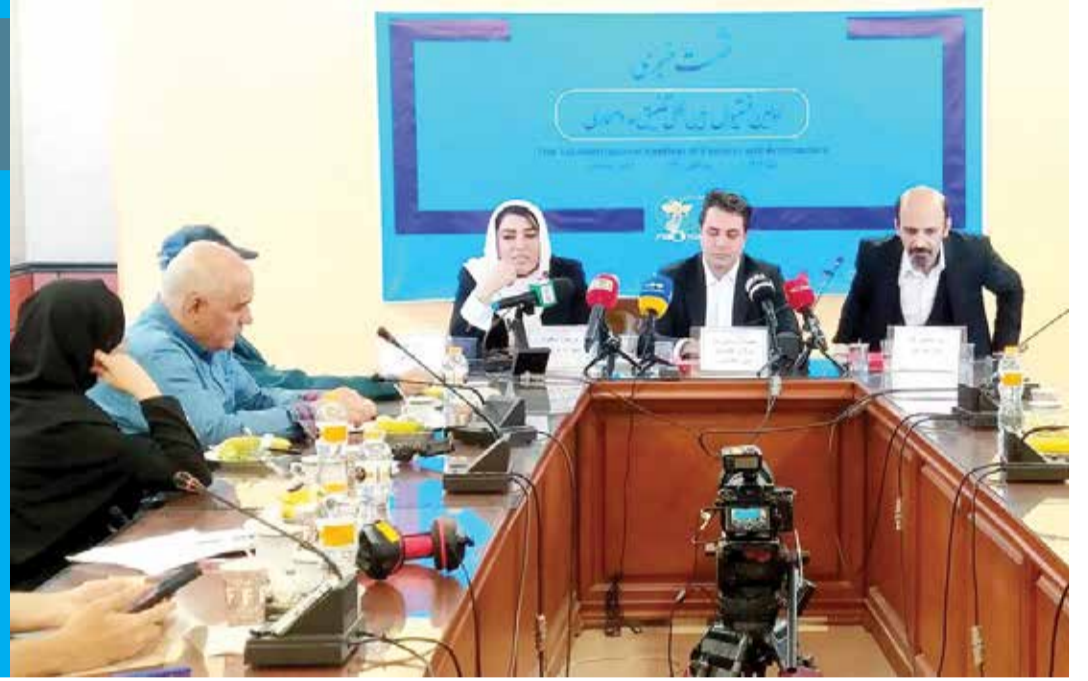
The picture shows the press conference of the first International Festival of Fashion and Architecture held in Tehran on October 22, 2023.