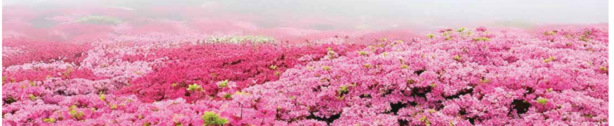
The town of Qamsar, Kashan