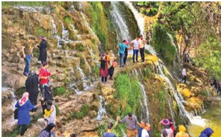
The town of Niasar, Kashan

He continued that ecotourism encompasses all aspects derived from the natural world: verdant landscapes, majestic mountains, dense forests, vast plains, arid deserts, meandering rivers, and expansive seas readily come