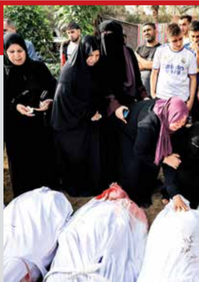
Women mourn by the bodies of Palestinian victims killed during Israeli bombardment, before their funerals outside the morgue at Nasser Hospital in Khan Yunis in the southern Gaza Strip on October 25, 2023.