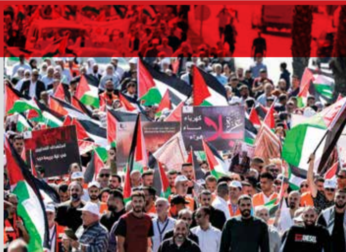
Protesters march with Palestinian flags during a rally in support with people in the Gaza Strip, in the city of Ramallah in the occupied West Bank, Palestine, on October 25, 2023.