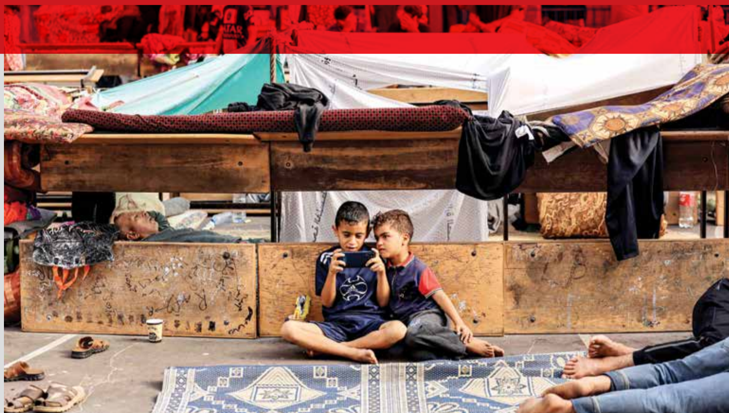
A child sits next to another playing a game on a cell phone in the playground of a school run by the United Nations Relief and Works Agency for Palestine Refugees agency that has been converted into a shelter for displaced Palestinians in Khan Yunis in the southern Gaza Strip on October 25, 2023.

Israel rains down bombs on the Gaza Strip, slaughtering hundreds of civilians on a daily basis, despite international outcry. Every day, people in the Palestinian territory see parents who lose their children and vice versa. So far, more than 2,700 innocent children have fallen victim to Israeli savagery. These photos show death and destruction caused by Israeli strikes as well as demonstrations held in support of the people of Gaza.