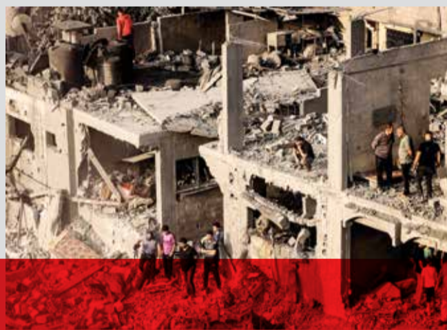
People search for survivors and the bodies of victims through buildings that were destroyed during Israeli bombardment, in Khan Yunis in the southern Gaza Strip on October 25, 2023.