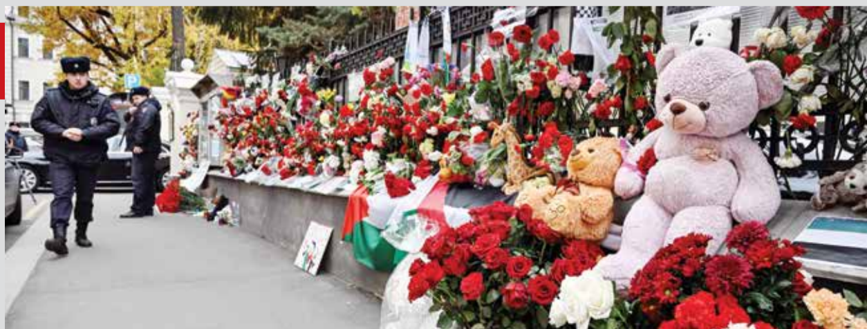
Policemen guard next to the Palestinian Embassy in Moscow, where flowers and toys were laid in memory of the victims, especially children, who have been killed in Israel's attacks on Gaza Strip on October 25, 2023.