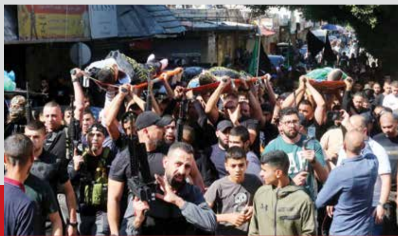
Mourners walk in the funeral procession of three Palestinians killed by Israeli fire in the latest violence in the occupied West Bank, at the Jenin refugee camp on October 25, 2023.