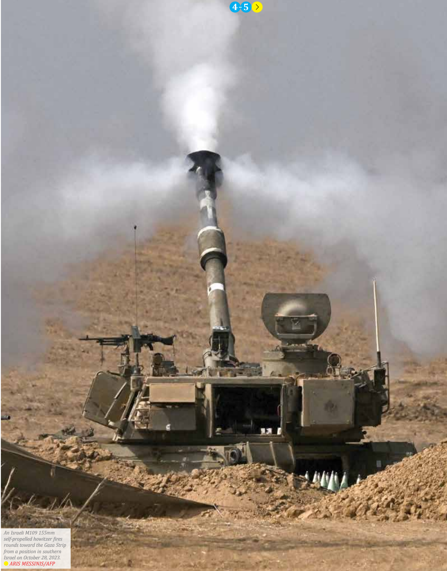
An Israeli M109 155mm self-propelled howitzer fires rounds toward the Gaza Strip from a position in southern Israel on October 28, 2023.