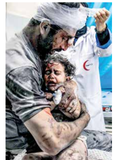
A man holds a child as they receive treatment at a trauma ward in Nasser Hospital in Khan Younis, Gaza, while UNICEF warns "Almost every child in the Gaza Strip has been exposed to deeply distressing events and trauma."