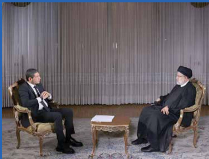
Iranian President Ebrahim Raisi (R) is seen in an interview with Al Jazeera TV in Tehran on October 28, 2023.

Iranian President Ebrahim Raisi said on Sunday that Israel's ongoing bombardment of Gaza "may force everyone" to act in the latest warning issued by Tehran since the start of the Israel-Hamas conflict. "The crimes of the Zionist regime have crossed the red lines, and this may force everyone to take action," Raisi said on X, formerly Twitter. Also in an interview with Al Jazeera TV on Saturday, he slammed the United States' unbridled support for Israel in its war on Gaza, saying, "Washington asks us not to do anything, but they keep giving widespread support to Israel and this is not acceptable."