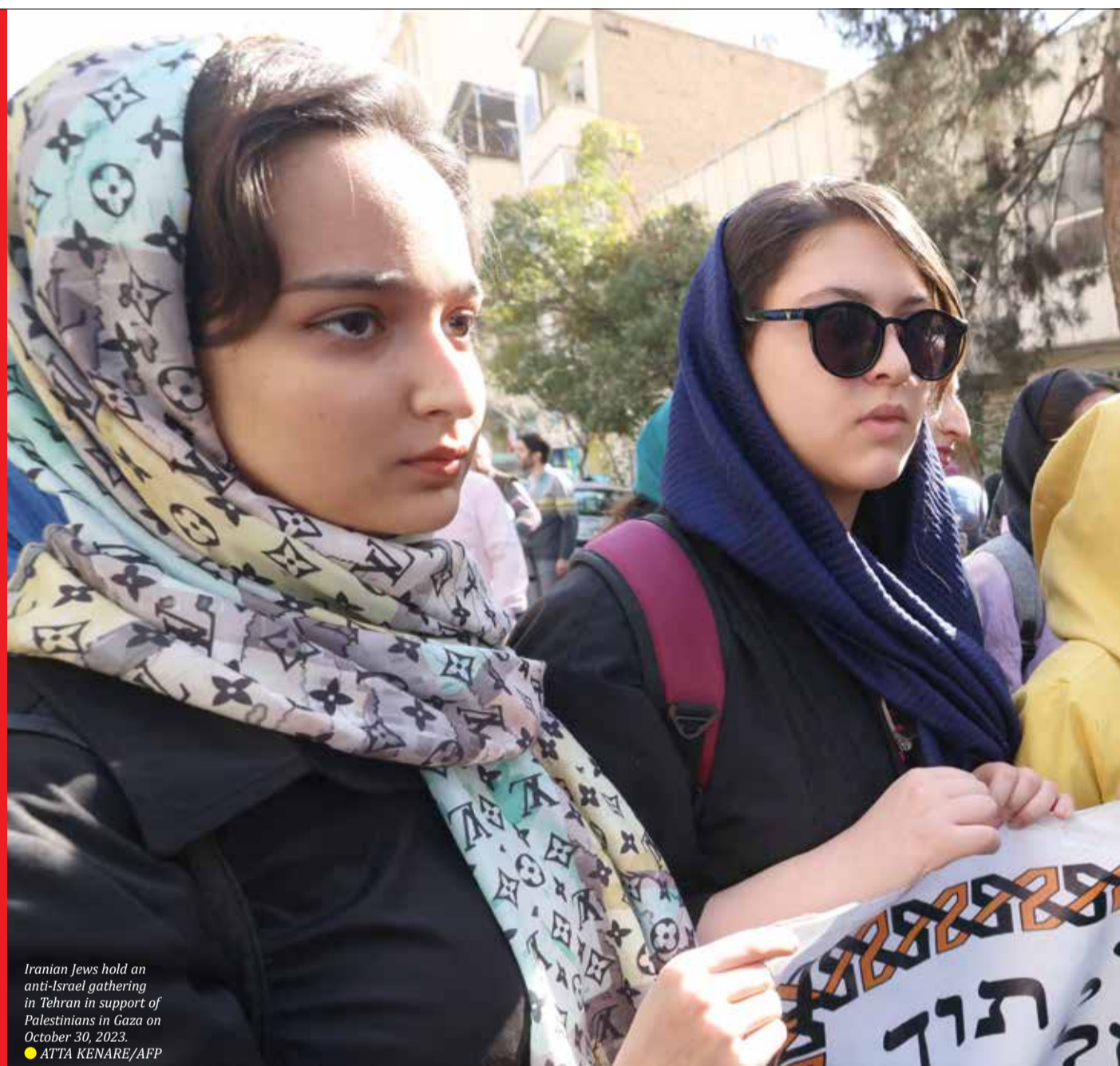
Iranian Jews hold an anti-Israel gathering in Tehran in support of Palestinians in Gaza on October 30, 2023.