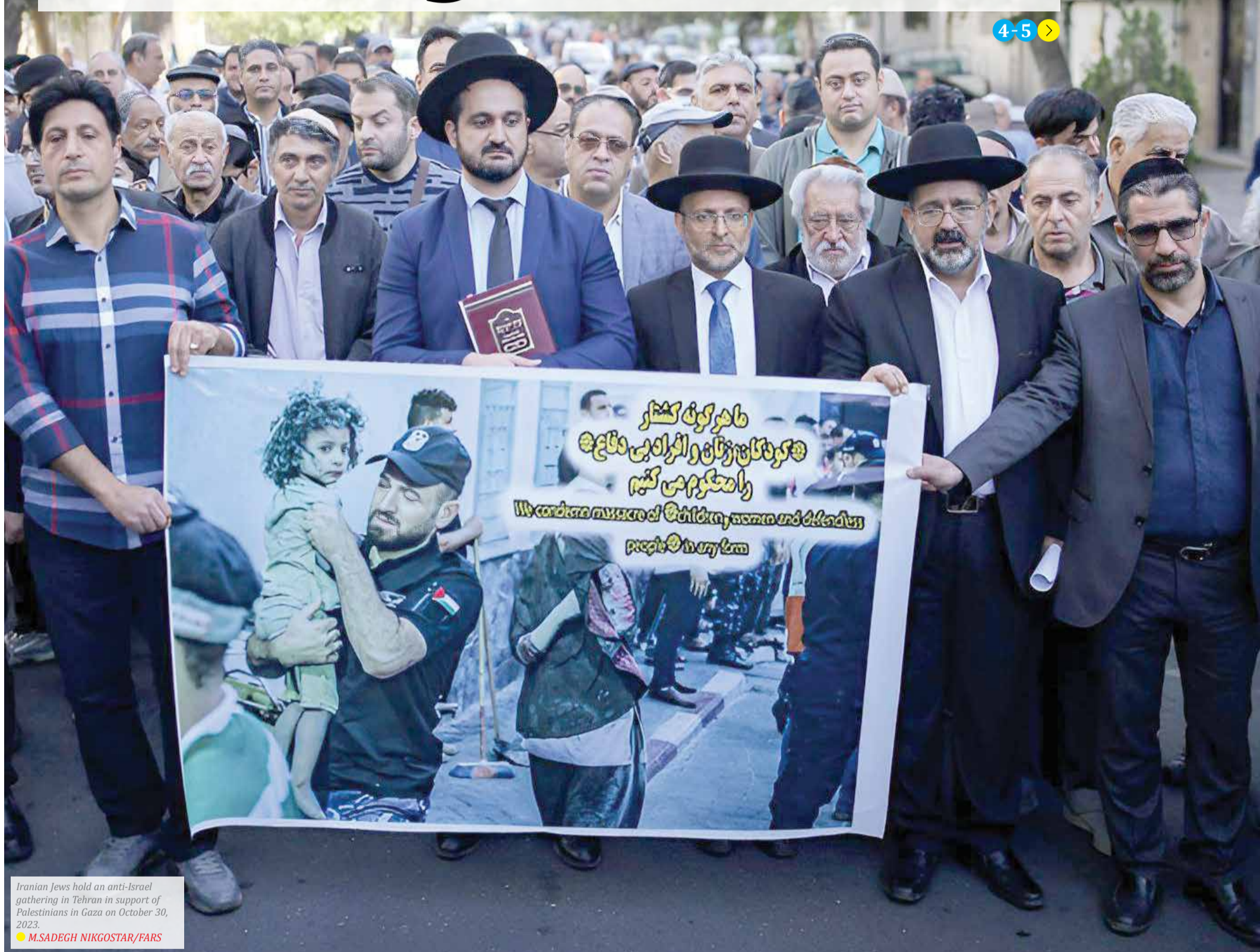
Iranian Jews hold an anti-Israel gathering in Tehran in support of Palestinians in Gaza on October 30, 2023.