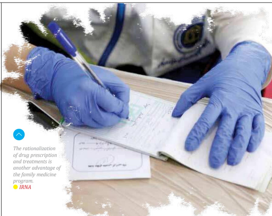
The rationalization of drug prescription and treatments is another advantage of the family medicine program. ● IRNA