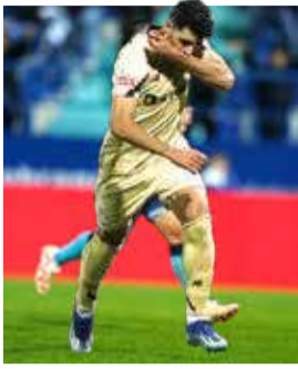
Porto striker Mahdi Taremi celebrates after scoring from the spot during a 2-0 victory over FC Vizela in Liga Portugal in Caldas de Vizela, Portugal, on October 29, 2023.