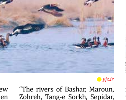
and Barm Alvan Wetland are magical places that warmly welcome migratory Asian birds every year from late September until the end of winter," he added. Pakbaz stressed that simulta-

grations, birds rest for a few days to relieve fatigue and then migrate towards Khuzestan or Bushehr provinces. Long-term migrants, on the other hand, stay near the lake and rivers of the province until the end of