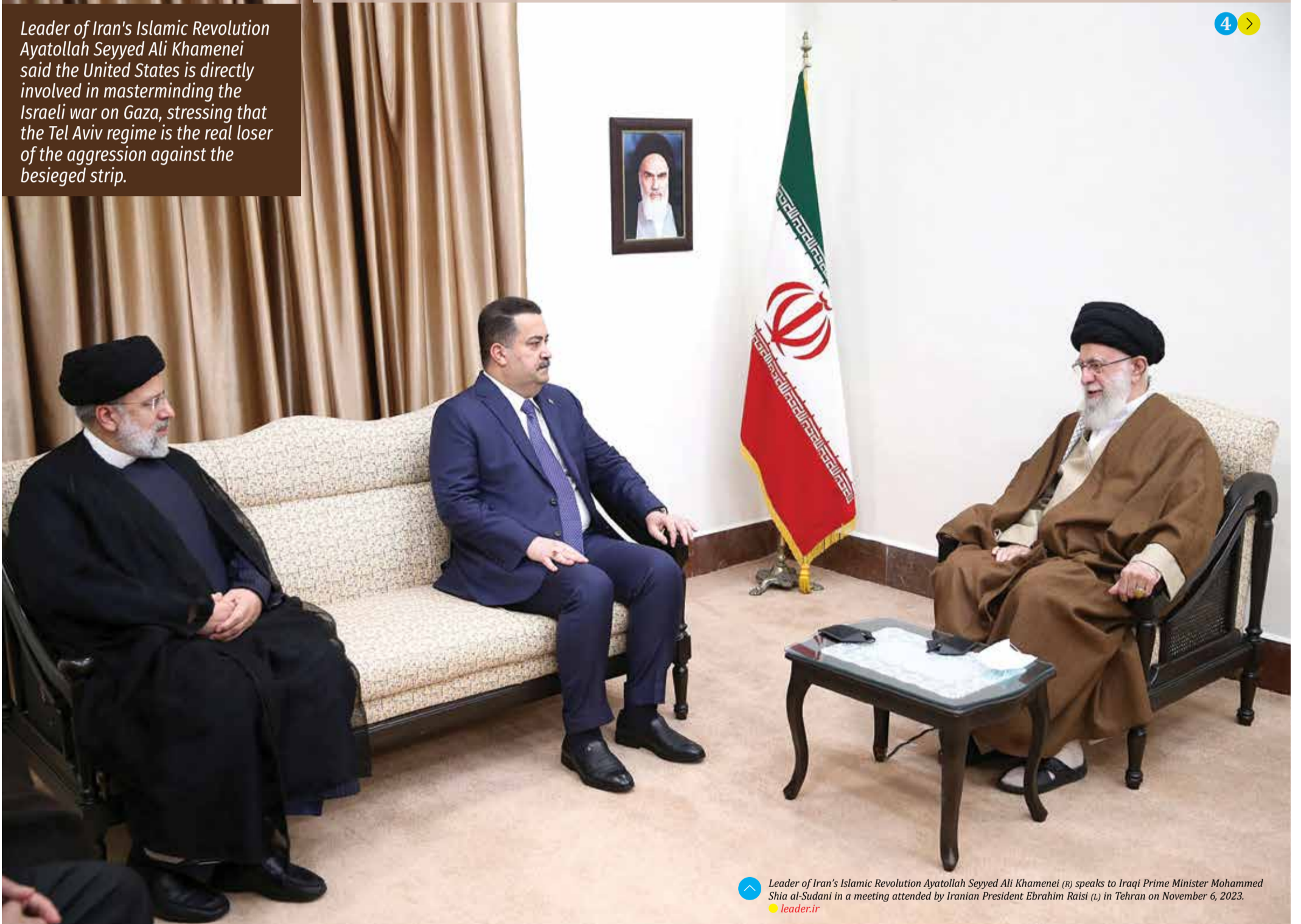
Leader of Iran's Islamic Revolution Ayatollah Seyyed Ali Khamenei (R) speaks to Iraqi Prime Minister Mohammed Shia al-Sudani in a meeting attended by Iranian President Ebrahim Raisi (L) in Tehran on November 6, 2023.

Leader of Iran's Islamic Revolution Ayatollah Seyyed Ali Khamenei said the United States is directly involved in masterminding the Israeli war on Gaza, stressing that the Tel Aviv regime is the real loser of the aggression against the besieged strip.