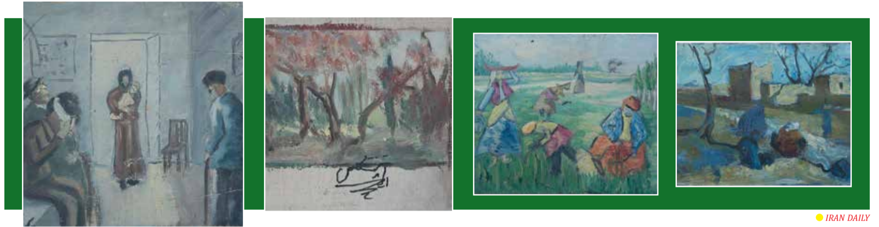
● IRAN DAILY