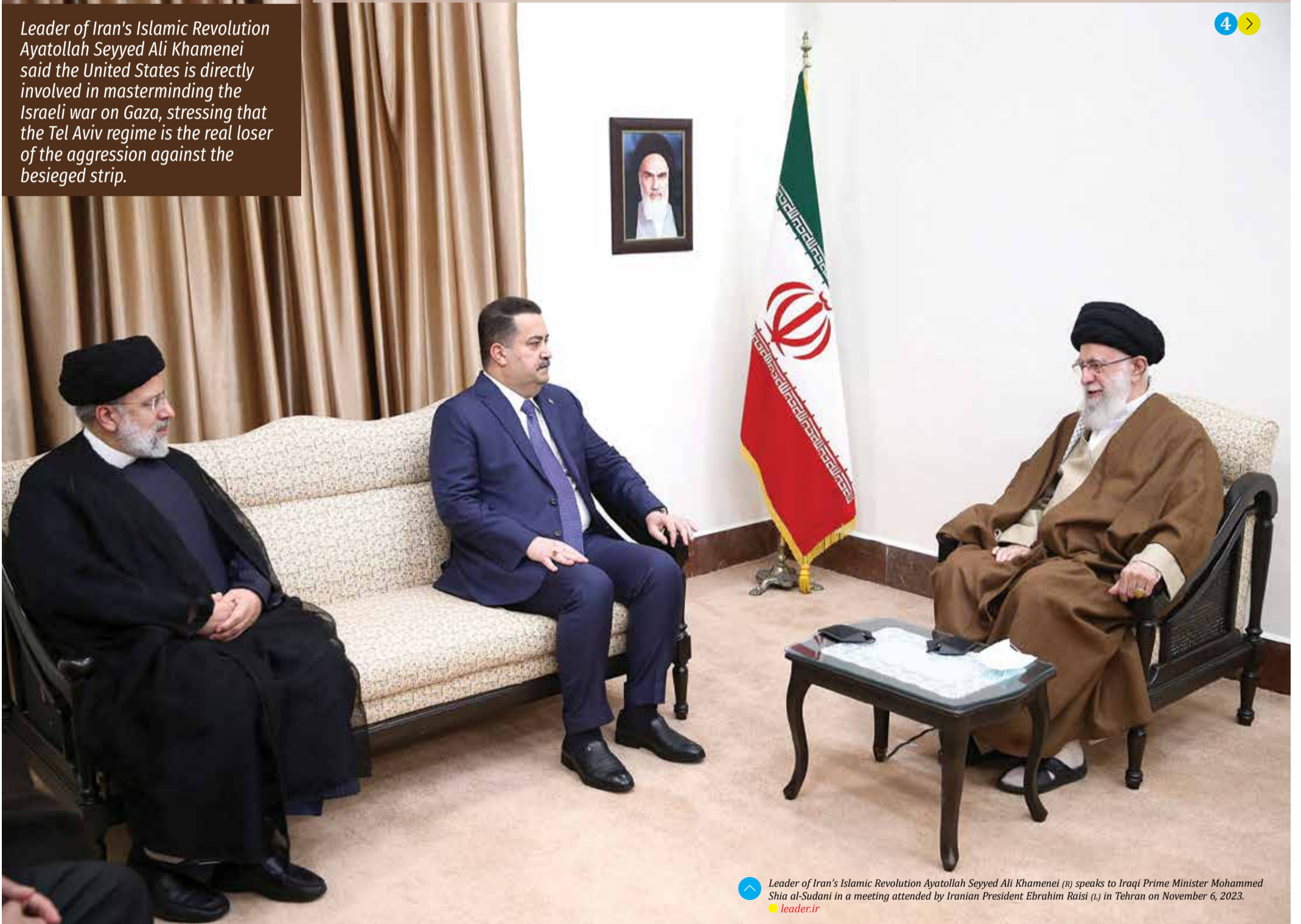
Leader of Iran's Islamic Revolution Ayatollah Seyyed Ali Khamenei (R) speaks to Iraqi Prime Minister Mohammed Shia al-Sudani in a meeting attended by Iranian President Ebrahim Raisi (L) in Tehran on November 6, 2023.

Leader of Iran's Islamic Revolution Ayatollah Seyyed Ali Khamenei said the United States is directly involved in masterminding the Israeli war on Gaza, stressing that the Tel Aviv regime is the real loser of the aggression against the besieged strip.