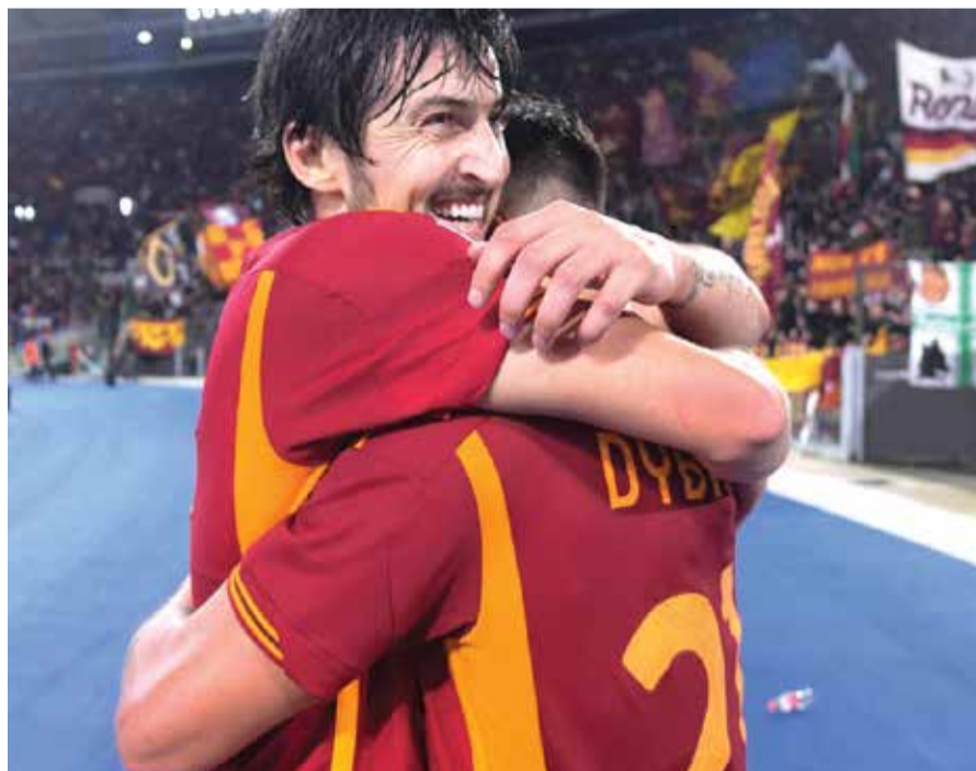
AS Roma striker Sardar Azmoun (l.) celebrates with Argentine Paulo Dybala during a 2-1 victory over Lecce in Serie A at the Stadio Olimpico, Rome, Italy, on November 5, 2023.