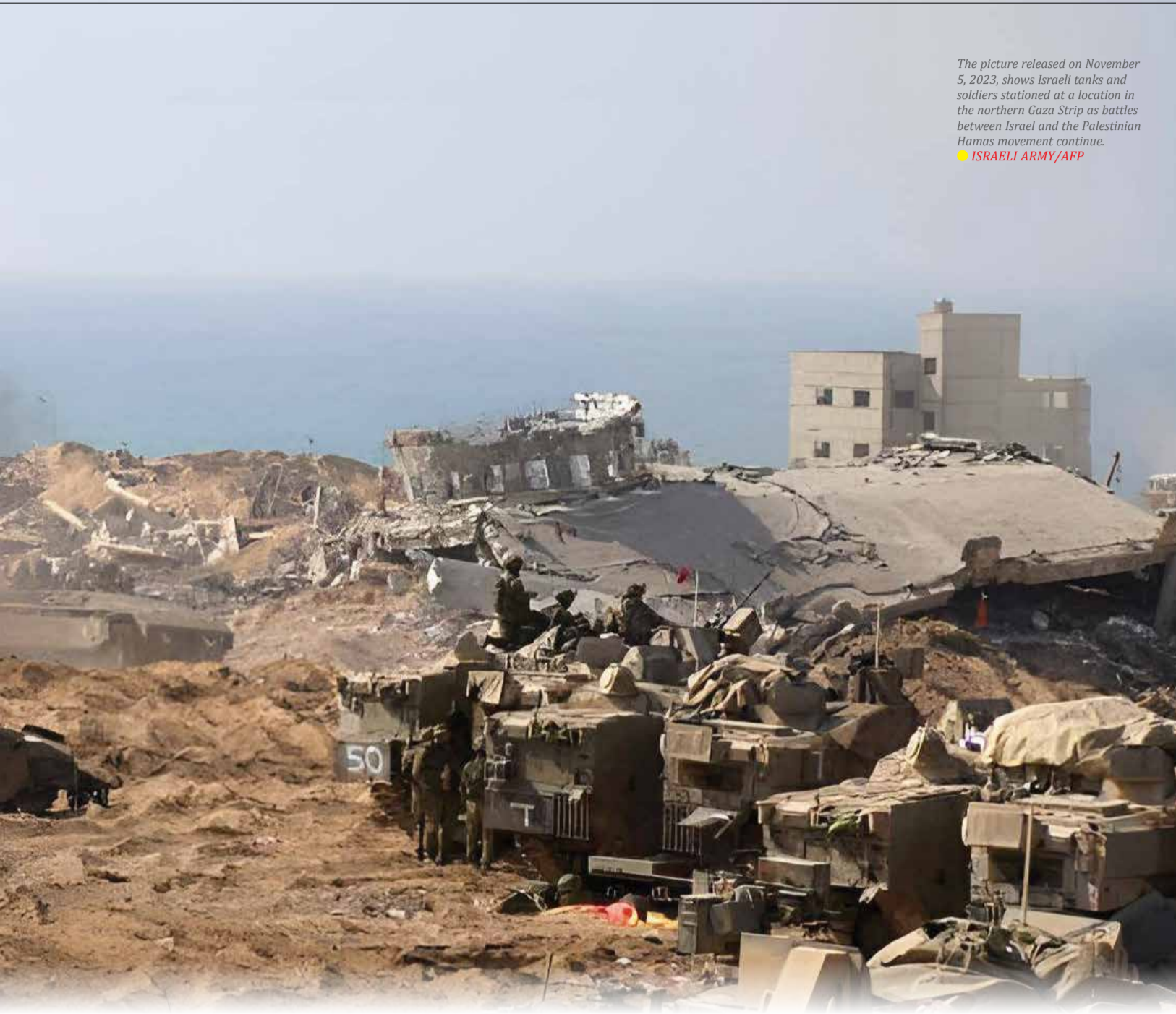
The picture released on November 5, 2023, shows Israeli tanks and soldiers stationed at a location in the northern Gaza Strip as battles between Israel and the Palestinian Hamas movement continue.