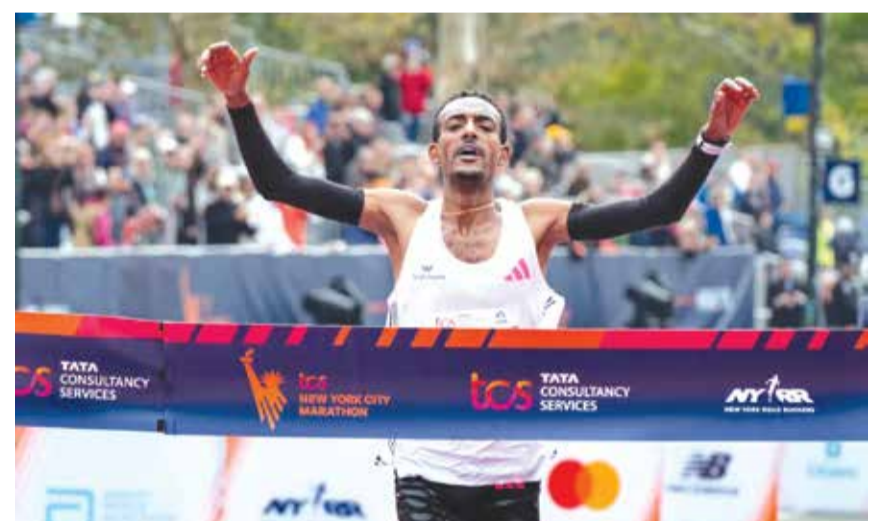
Ethiopian Tamirat Tola crosses the finish line in the men's race of the New York City Marathon on Nov. 5, 2023.