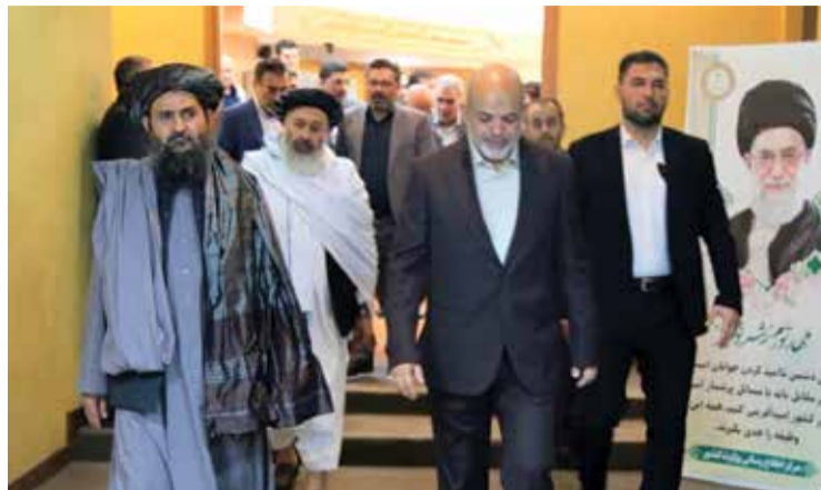
Iranian Minister of the Interior Ahmad Vahidi (2nd R) and Afghanistan's Deputy Prime Minister for Economic Affairs Mullah Abdul Ghani Baradar (L) are seen ahead of a meeting in Tehran on November 6, 2023.

Monday that during the meetings with Iranian top officials, key discussions were held on political and economic relations, "effective" coordination between their respective nations, water resource management, transit agreements, and enhancement of Afghanistan's imports and exports through Iran, Anadolu Agency reported. Expressing gratitude to Tehran for hosting Afghan refugees, Baradar acknowledged Iran's "commitment to Islamic values, humanitarianism, and the rights and norms concerning refugees." Baradar, who arrived in Tehran on Saturday, has also held talks with Iranian Foreign Minister Hossein Amir-Abdollahian, and Secretary of Iran's Supreme National Security Council (SNSC) Ali Akbar Ahmadian. The Taliban statement quoted Ahmadian addressing the visiting Afghan delegation that Iran and Afghanistan "play a crucial role in China's One Belt One Road Initiative." "Both sides agreed to capitalize on the opportunities at hand and ensure that no external factors negatively impact the strong relationship between Iran and Afghanistan," the statement said. During the Sunday meeting, the SNSC chief said Iran supports Afghanistan's