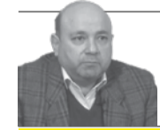
By Emad Abshenas Middle East affairs expert