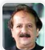
● Majid Majidi