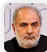
● Parviz Parastouei