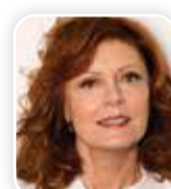
● Susan Sarandon

The latest star facing cancellation calls is actress and activist Susan Sarandon, after the 77-year-old declared support for Palestinians on social media. Taking to X—the social network formerly known as Twitter—on November 4, Sarandon reposted a photo of herself on stage at the #March4Palestine protest in Washington, D.C., according to Newsweek.