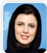
● Leila Hatami