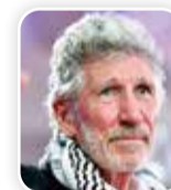
● Roger Waters