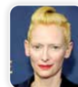
● Tilda Swinton