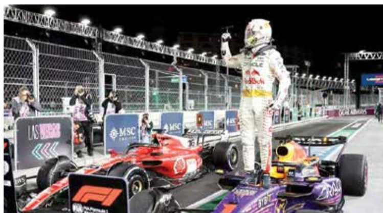
Red Bull's Max Verstappen celebrates winning the Las Vegas Grand Prix in Las Vegas, NV, US, on Nov. 18, 2023.

"The stewards gave me a penalty for that and it put us on the back-foot. I had to pass quite a few cars and there was the Safety Car, so at that point there was a lot going on,"