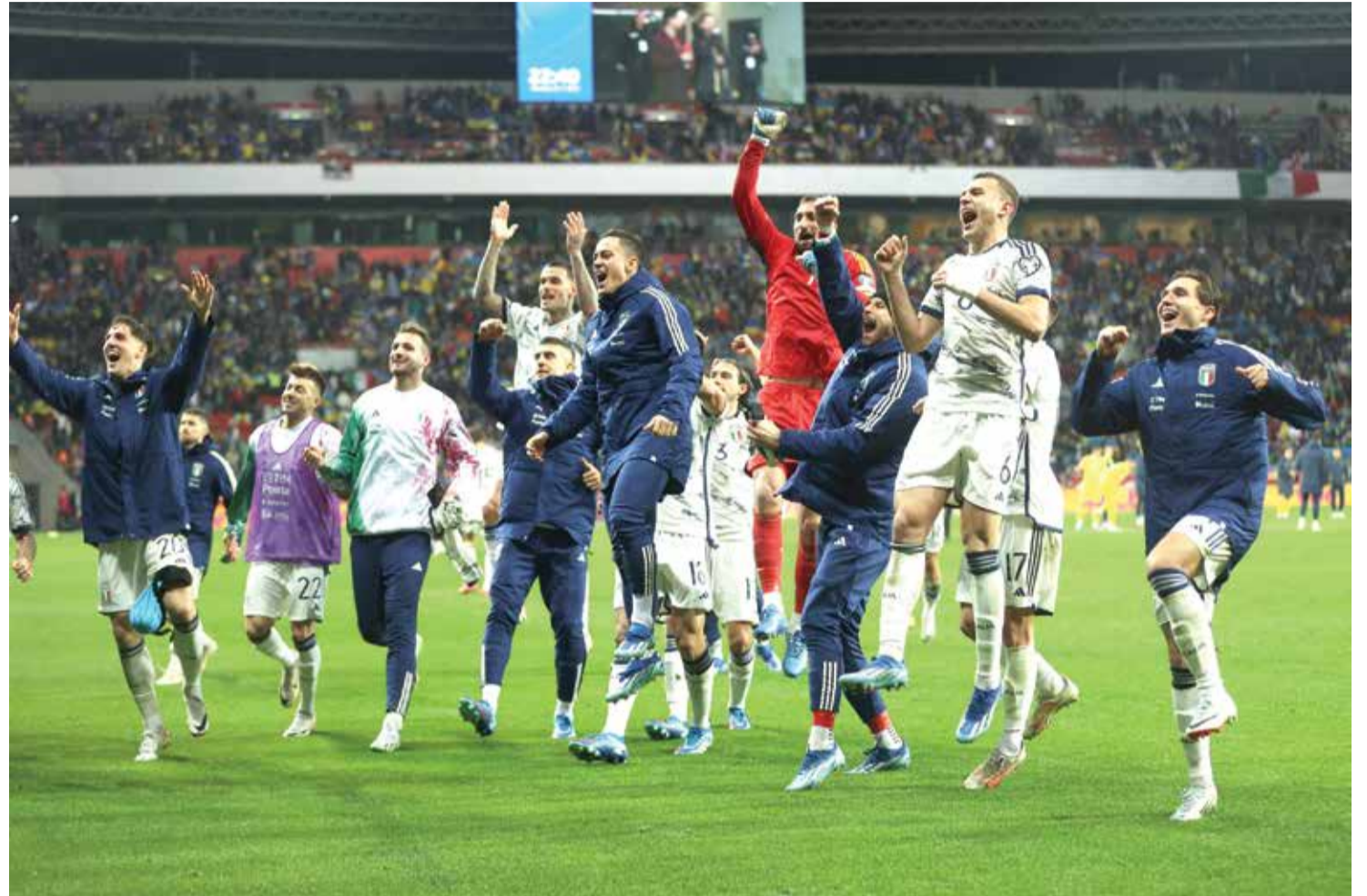
Italian players celebrate qualifying for the Euro 2024 after a goalless draw against Ukraine in Leverkusen, Germany, on November 20, 2024.

The final score belied the true nature of the match, with Italy's high-octane attack and Ukraine's counter-attacking threat creating several chances for both teams. Ukraine had a late penalty appeal turned down, despite Italy midfielder Bryan Cristante looking to have made contact with Mykhailo Mudryk's foot in injury time. "From my point of view that was a penalty, but again I was not there and it's only about my emotions," Ukraine coach Serhiy Rebrov told a post-match press conference.