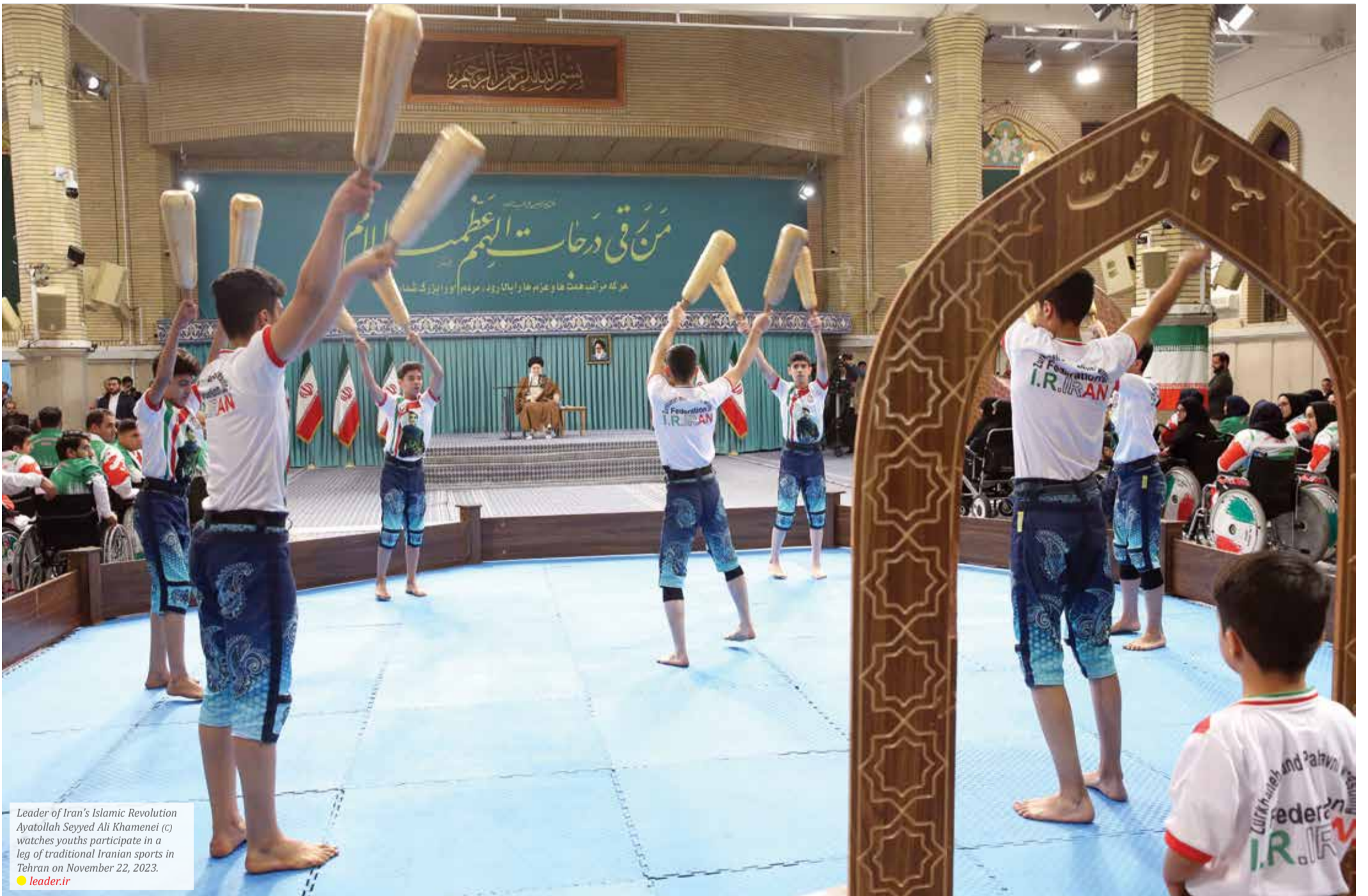
Leader of Iran's Islamic Revolution Ayatollah Seyyed Ali Khamenei (c) watches youths participate in a leg of traditional Iranian sports in Tehran on November 22, 2023.

Vol. 7442 • Thursday, November 23, 2023 • Azar 2, 1402 • Jumada al-Awwal 9, 1445 • Price 40,000 Rials • 8 Pages