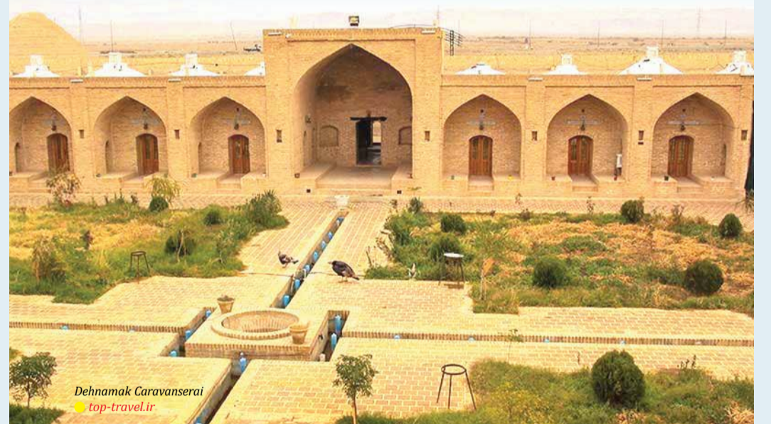
Dehnamak Caravansera top-travel.ir