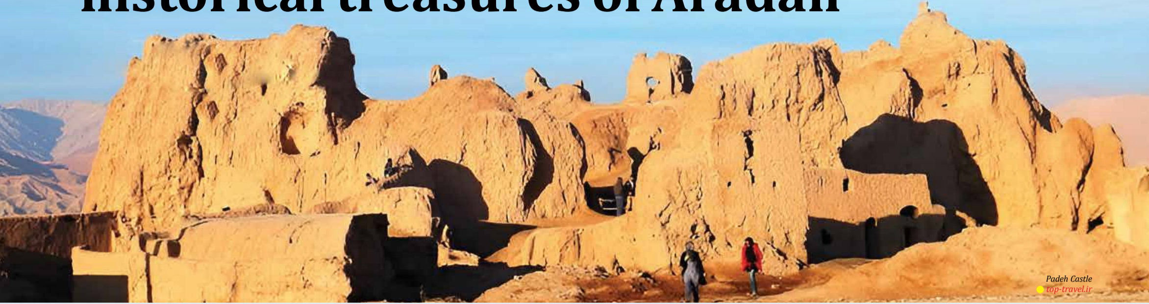
Padeh Castle