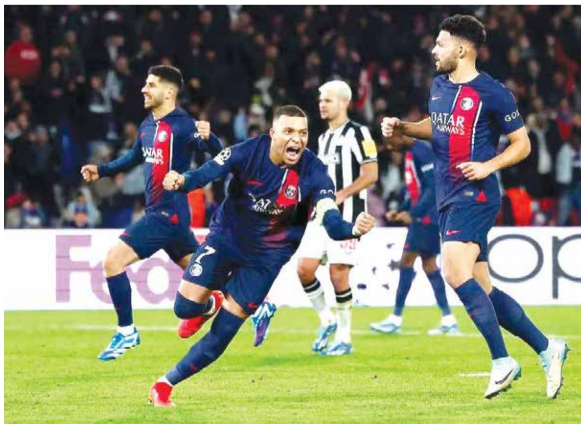
● Kylian Mbappe celebrates scoring PSG's equalizer against Newcastle United in Parc des Princes, Paris, France, on November 28, 2023.

PSG, who have reached the last-16 at least for the last 11 seasons, know that only a win in Dortmund will guarantee a last-16 place,