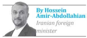
By Hossein Amir-Abdollahian Iranian foreign minister

The political and legal aspects of the Zionist regime's crimes in Gaza