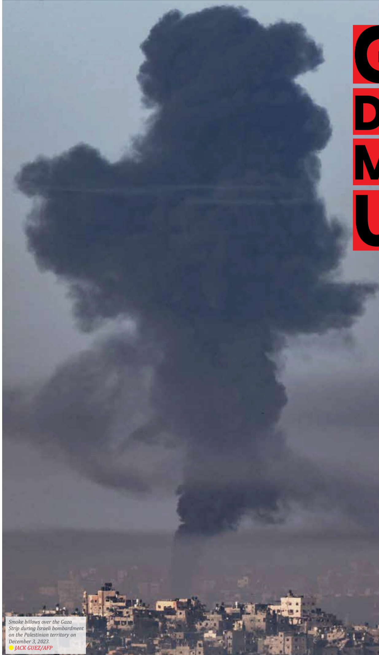
Smoke billows over the Gaza Strip during Israeli bombardment on the Palestinian territory on December 3, 2023.

Vol. 7451 • Monday, December 4, 2023 • Azar 13, 1402 • Jumada al-Awwal 20, 1445 • Price 40,000 Rials • 8 Pages