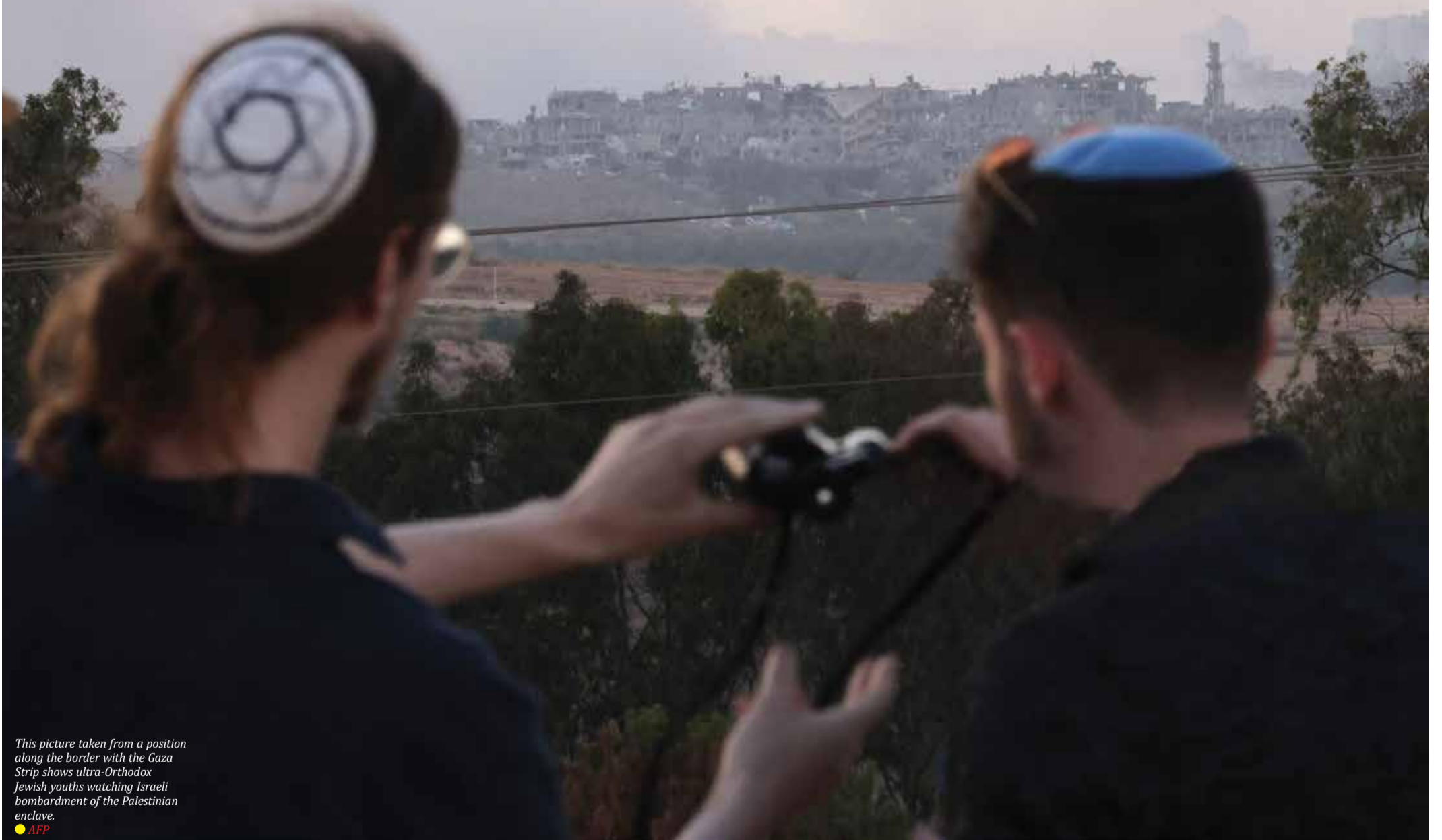
This picture taken from a position along the border with the Gaza Strip shows ultra-Orthodox Jewish youths watching Israeli bombardment of the Palestinian enclave.