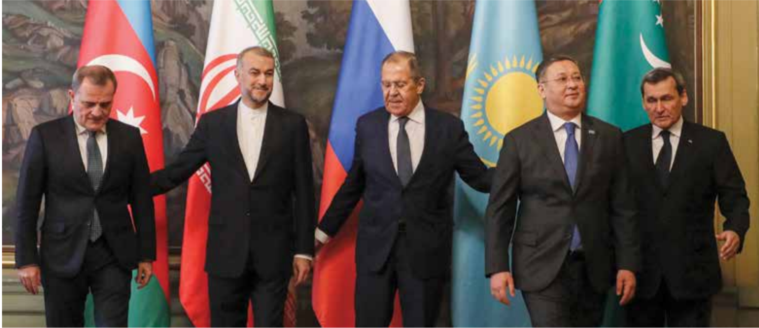
(L-R) Foreign ministers of Azerbaijan, Iran, Russia, Kazakhstan and Turkmenistan pose for a family photo during the annual meeting of the Caspian Sea littoral states in Moscow on December 5, 2023.

He said that using the capacities of the Caspian Sea without taking into account the interests of other coastal