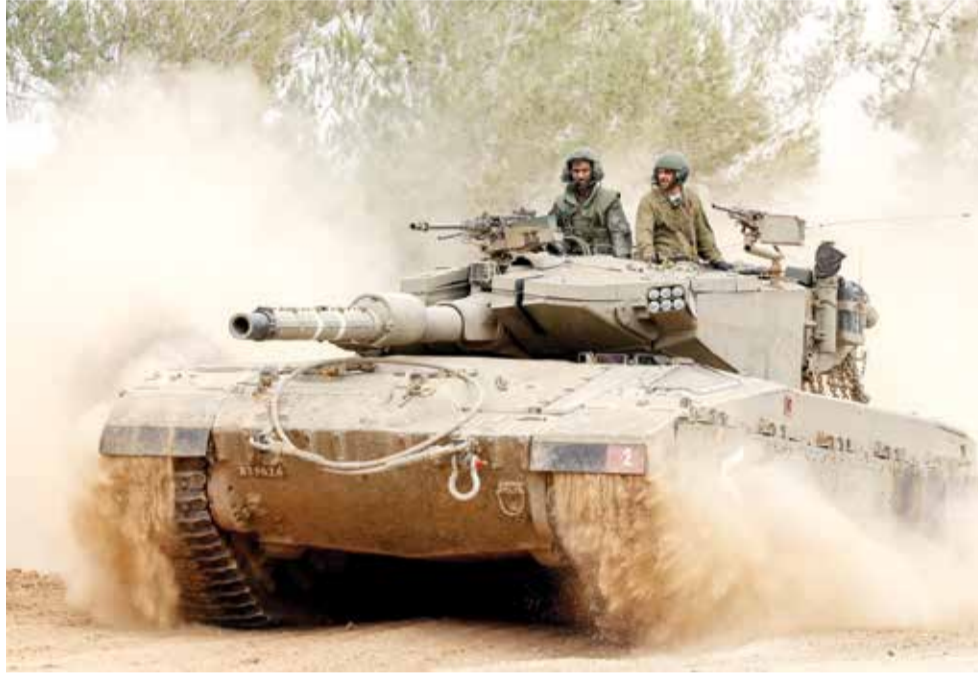
An Israeli military tank rolls near the Gaza Strip on December 5, 2023.