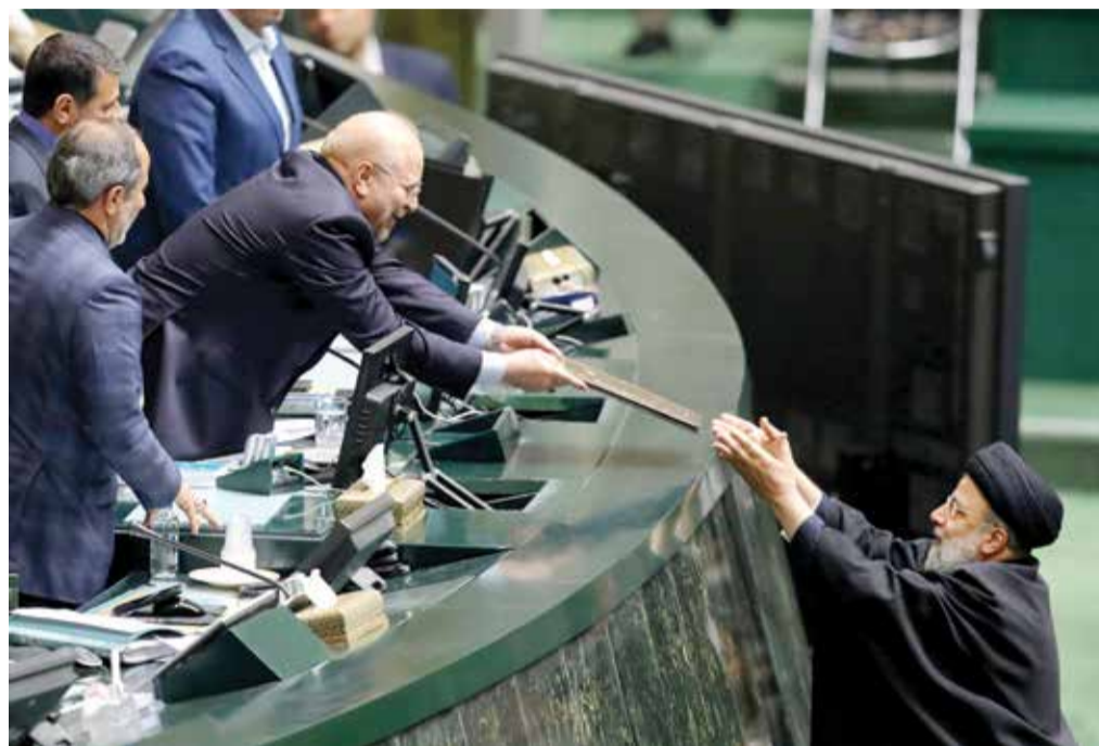
President Ebrahim Raisi (R) hands over the draft budget bill for next Iranian year to Parliament Speaker Mohammad-Baqer Qalibaf on December 5, 2023.

On the other hand, the share of tax revenues is twice the revenues from oil and gas sales, which means changing the budget approach from oil revenues to sustainable revenues.