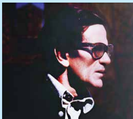
'Portrait of Pier Paolo Pasolini,' at Jaame' (Grand) Mosque, Isfahan, Iran; digital image of the original 1973 painting