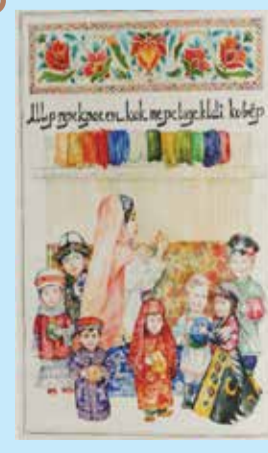
A school at the Embassy of the Russian Federation in the Islamic Republic of Iran

The beauty of our planet is in its diversity and every nation and every person fills it with new colors. Just like how every thread and knot in a Persian carpet contributes to a unique pattern, the multitude of cultures, traditions and people of the country symbolize the vibrant tapestry of our world. The artwork serves as a reminder that in the face of wars and conflicts, we have a shared responsibility to protect and preserve humankind and the beauty of our planet.