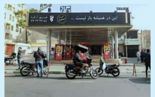
People wait at a gas station in Tehran on December 18, 2023, as fuel distribution across 70 percent of Iran's gas stations was disrupted due to a possible sabotage.

National TV said gas stations were seeking to provide fuel manually adding that over 50% of the stations were providing services and trials to get more back online were underway.